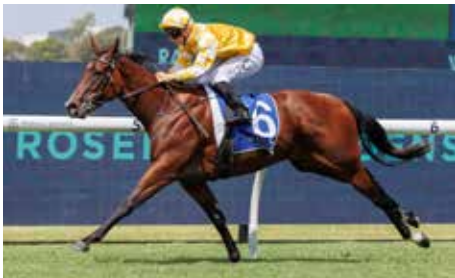
Lady Of Camelot