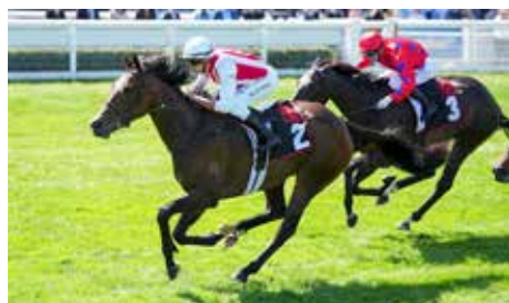
Getta Good Feeling