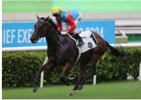
Ka Ying Rising