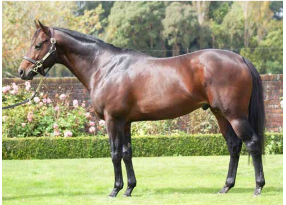
Per Incanto LITTLE AVONDALE STUD