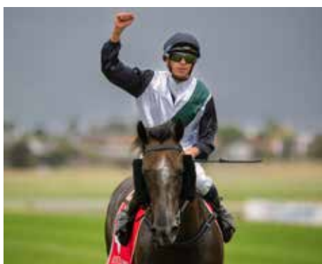
Little Brose LITTLE AVONDALE STUD

Jimmysstar became his sire's most successful elite-level performer when he claimed his third Group 1 as the odds-on favourite in the C.F. Orr Stakes (1400m) at Caulfield last spring, in the process taking his prize-money tally past the $8 million mark.