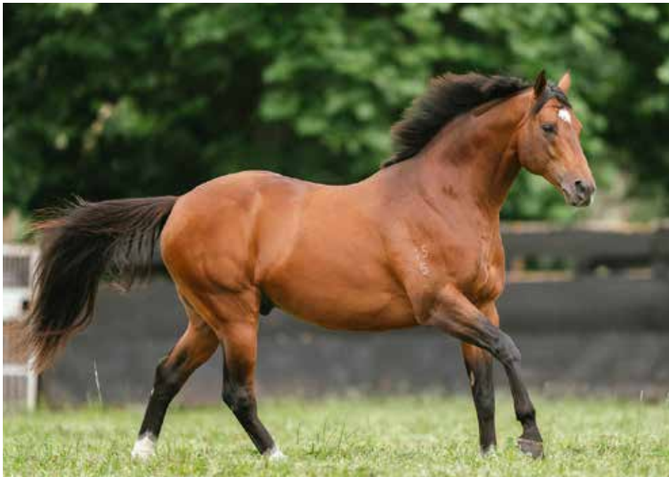
The Autumn Sun