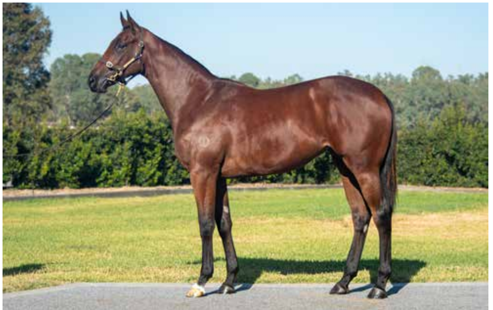
Marsept pictured as a yearling