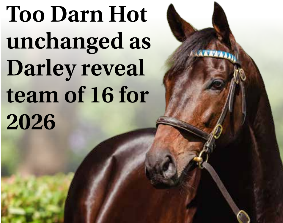
Too Darn Hot