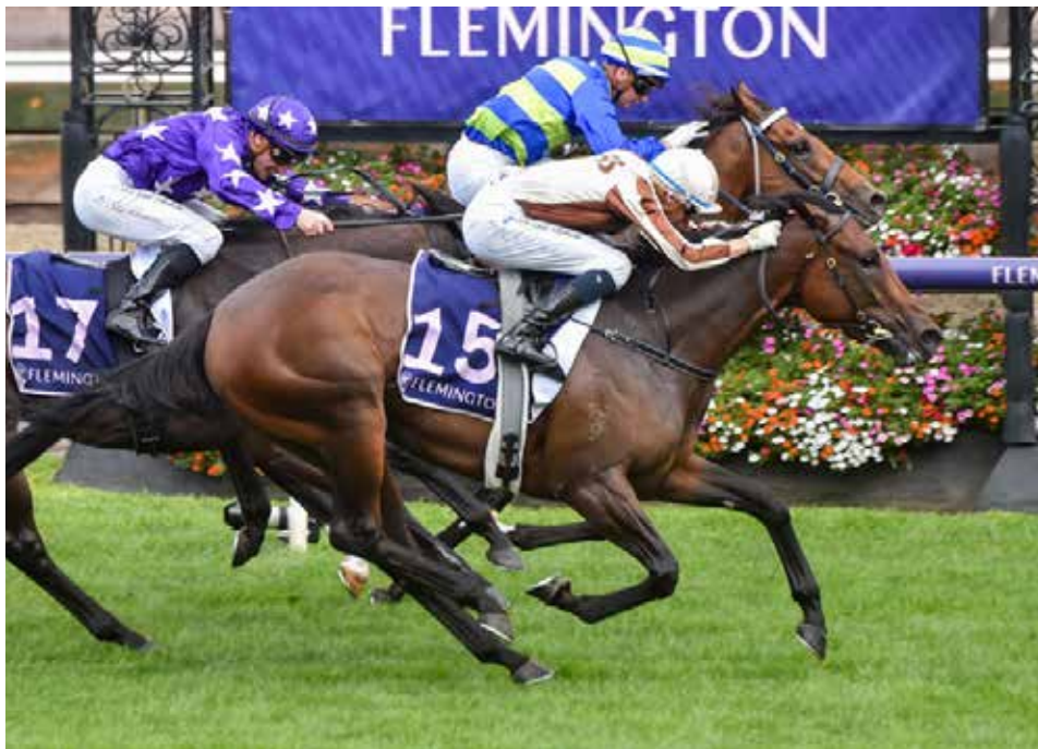
Legarto defeats Attrition in the Australian Guineas

Three mares believed in foal to world class strike-rate sire Extreme Choice (Not A Single Doubt) will be well sought out as well as others covered by the likes of Anamoe (Street Boss),