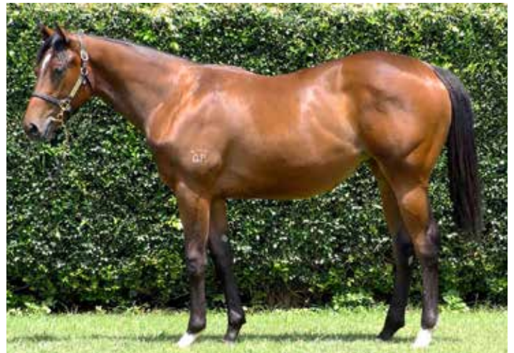
Affari pictured before the Magic Millions Yearling Sale