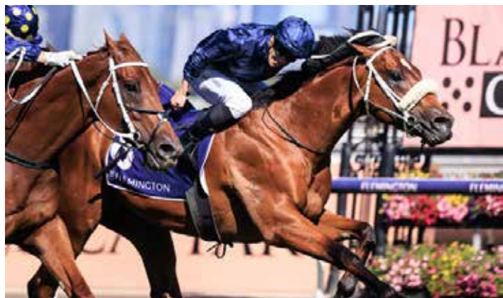
Home Affairs defeats Nature Strip in the Group 1 Lightning Stakes