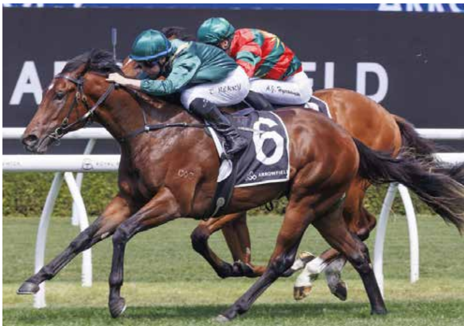
Incognito wins the Group 3 Breeders' Plate for Newgate sire Stay Inside