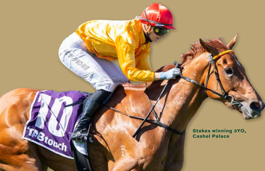
Stakes winning 3YO, Cashel Palace

Winning I Am Invincible half-sister to Gr.1 Golden Slipper winner and exciting young sire FARNAN with racing upside.