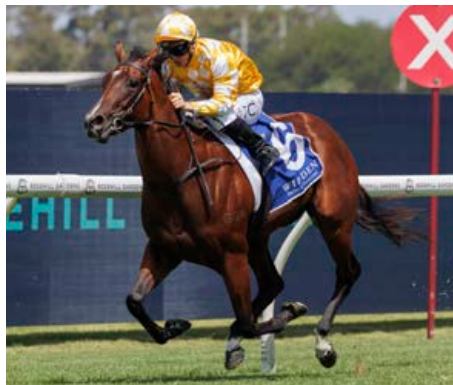
Lady Of Camelot