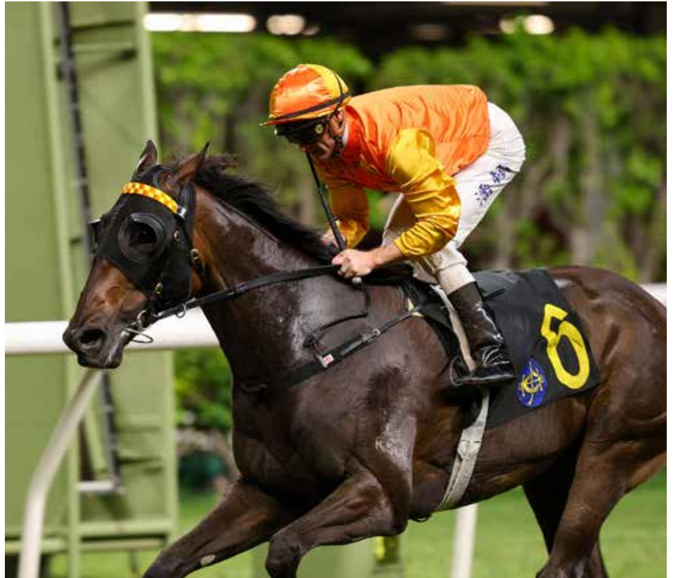
Armor Golden Eagle