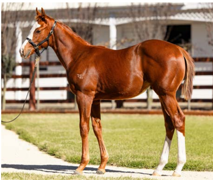
Lot 126: Toronado ex Yangarra Rose colt

Toronado needs no introduction adding his latest Australian stakes winner, Silvasista, as recently as Anzac Day and he has more stakes winners than any other sire in Hong Kong this season.