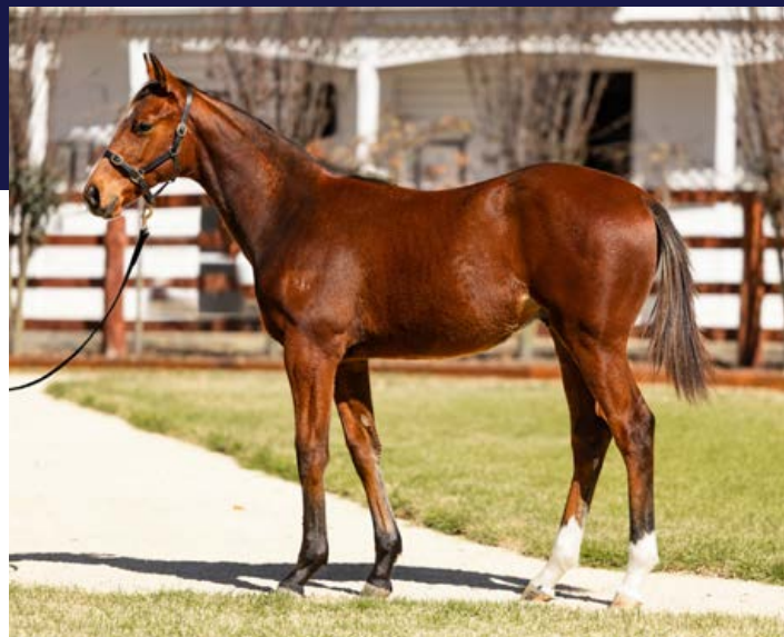
Lot 145: Shinzo ex Acquired colt