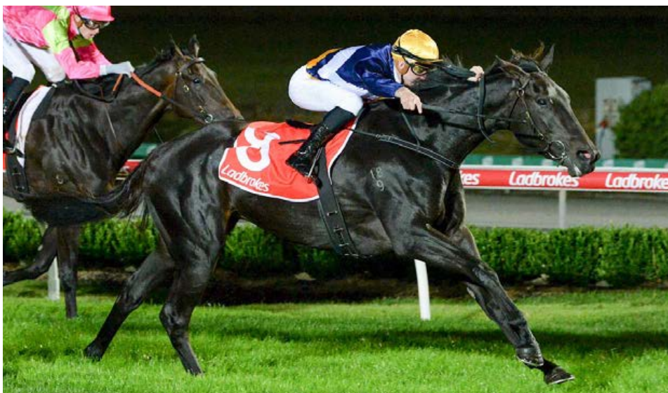
Affaire A Suivre