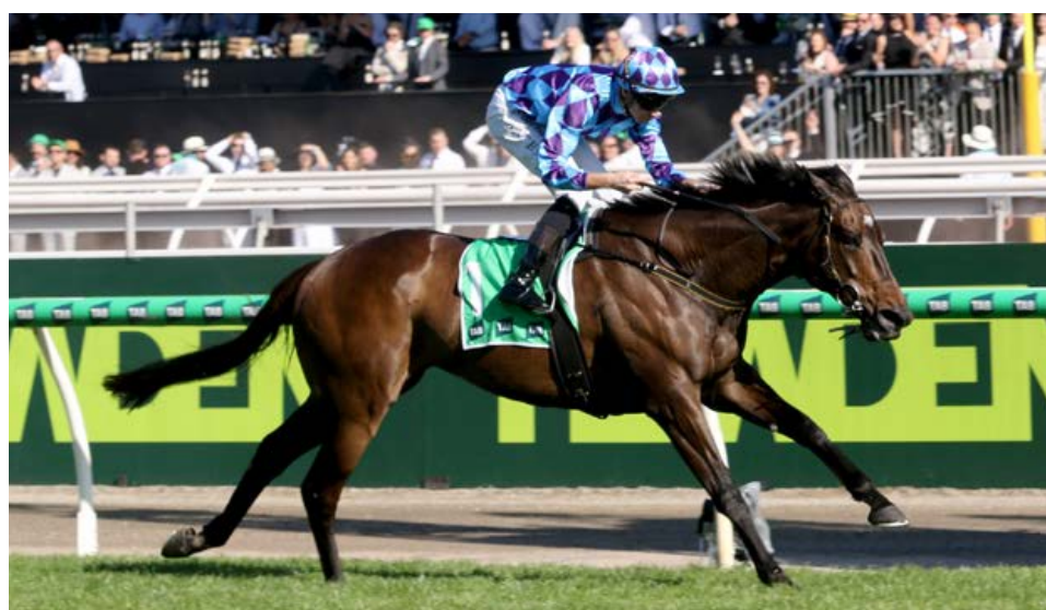
Pride Of Jenni