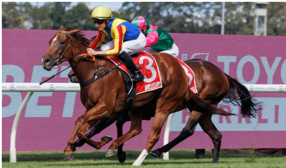
Flying For Fun