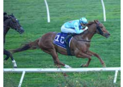
King Of Roseau