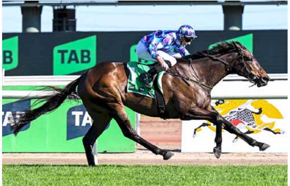
Pride Of Jenni