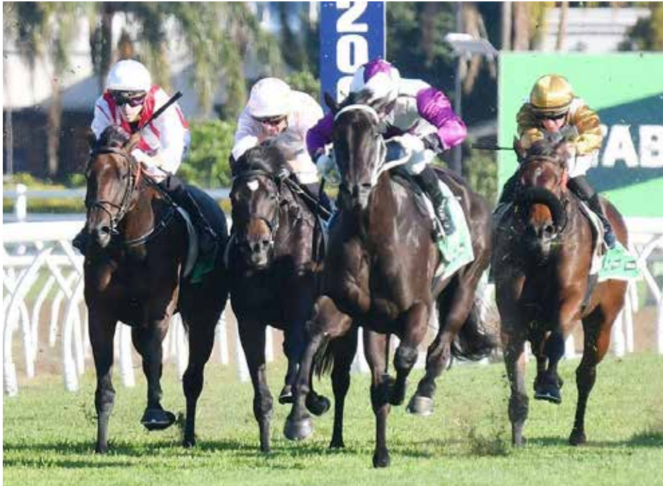
Nightline (purple and white silks)