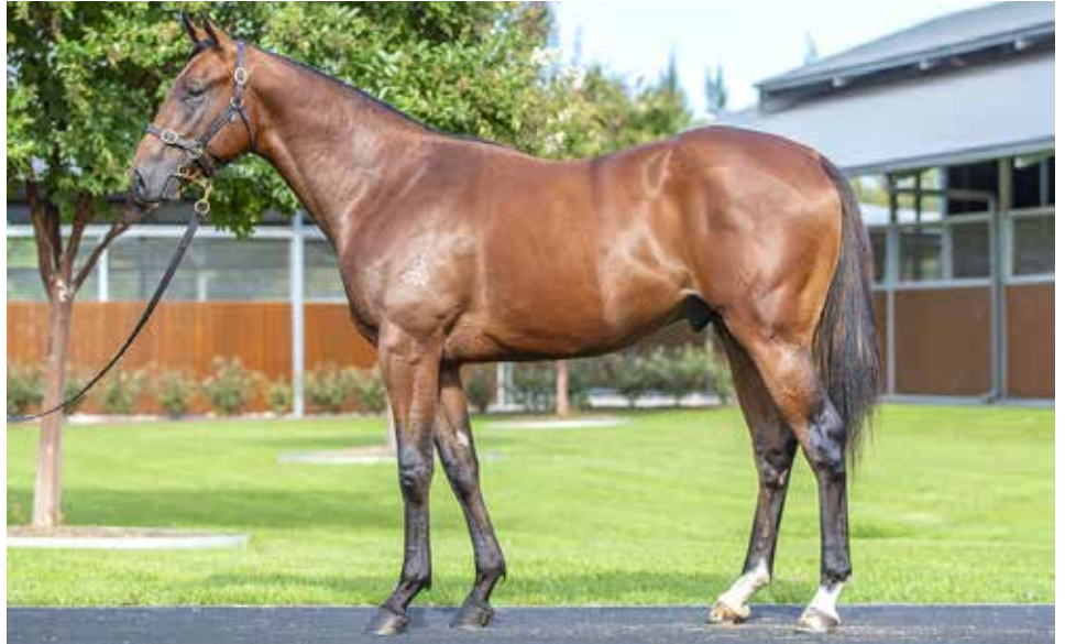
Attorney General pictured as a yearling