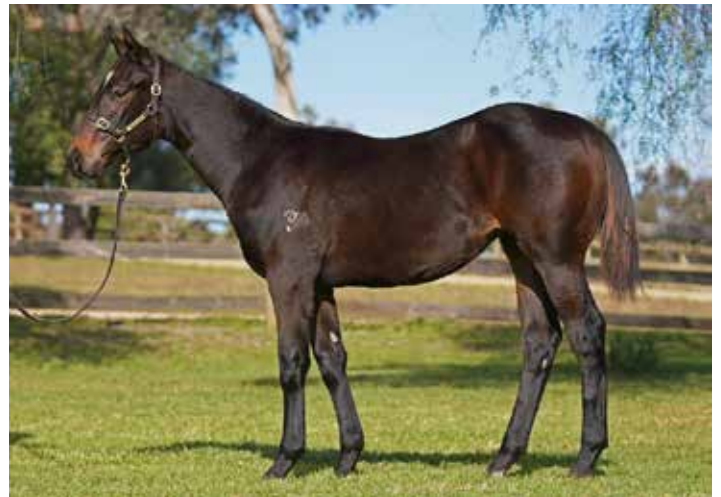
Lot 196: Native Trail ex Vintage colt