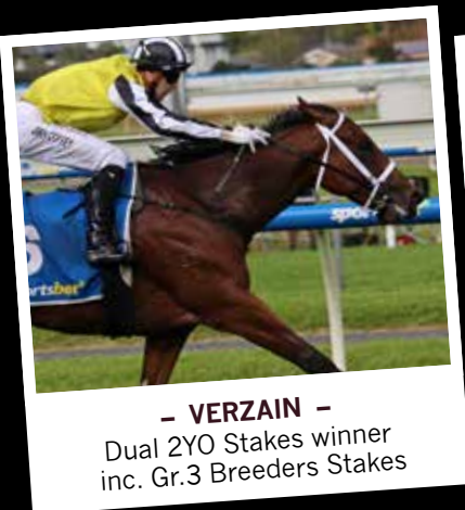
- VERZAIN - Dual 2YO Stakes winner inc. Gr.3 Breeders Stakes

2026 YEARLINGS sold up to $375,000 and WEANLINGS to $320,000, averaging $125,000