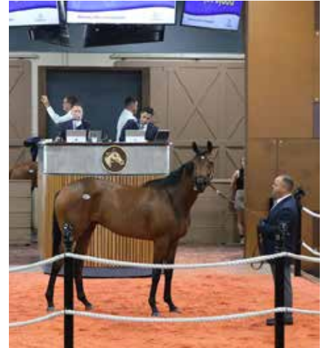
The $1.37 million Gun Runner filly