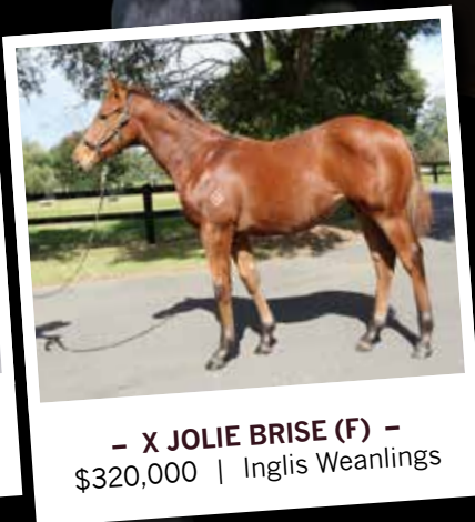
- X JOLIE BRISE (F) - $320,000 | Inglis Weanlings