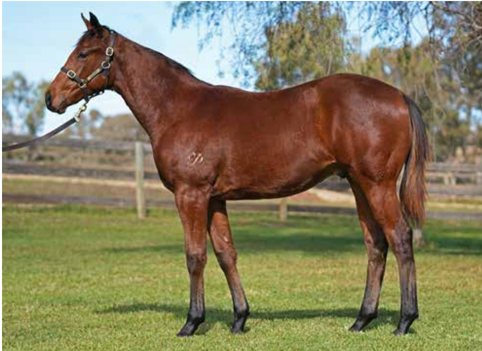
Lot 106: St Mark's Basilica ex Rhiannon colt