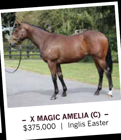
- X MAGIC AMELIA (C) - $375,000 | Inglis Easter