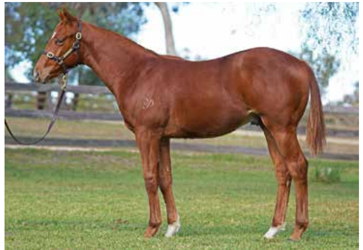
Lot 218: Ole Kirk ex Aayla Secura colt

The Magic Millions National Weanling Sale is recognised for its Group 1 graduates like Autumn Glow (The Autumn Sun), Zoustar, Pierro (Lonhro), Ellsberg (Spill The Beans), Tropical Squall (Prized Icon) and Stay Inside