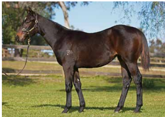
Lot 54: Zousain ex Miss Valor colt

"He's drawn wide and is dropping back to 1000 metres so that's always a query. He's also on the Sydney leg for the first time but, in saying all that, he's a well-educated horse and I don't think that will present any problems."