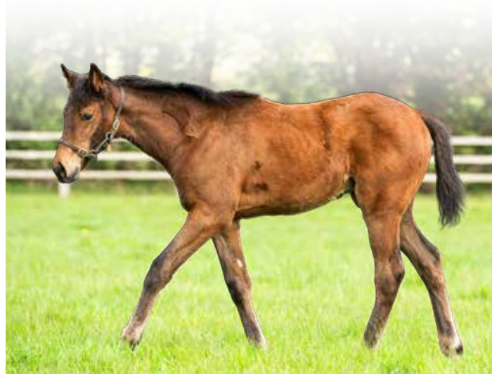
Colt ex. Cimeara