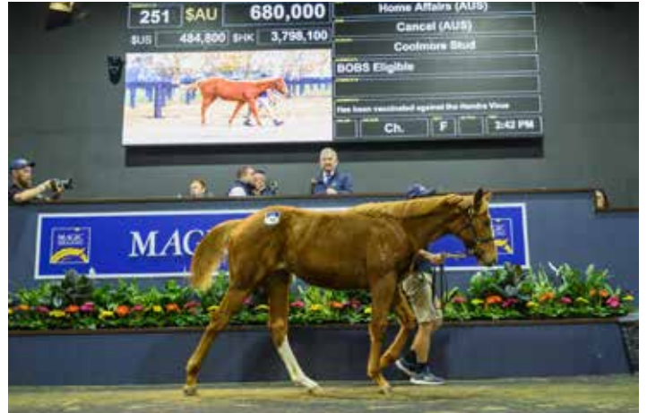
Lot 251: Home Affairs ex Cancel filly