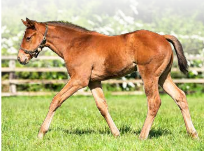
Filly ex. Princess Noor