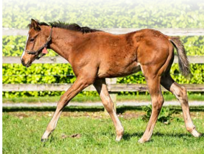
Colt ex. Symphony Perfect