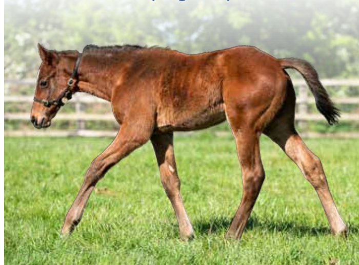
Colt ex. Pure Excellence