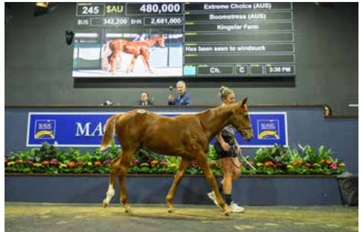
Lot 245 - Extreme Choice ex Boomstress