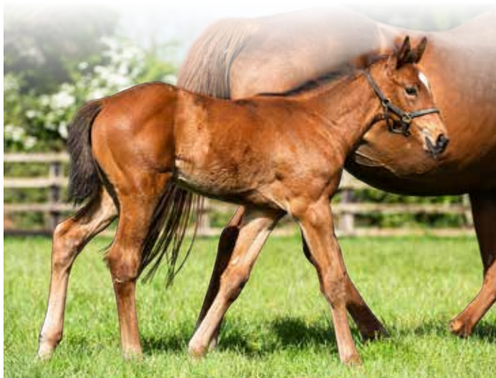
Colt ex. Attire