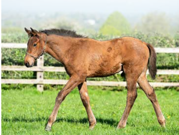
Colt ex. Lavenders Green