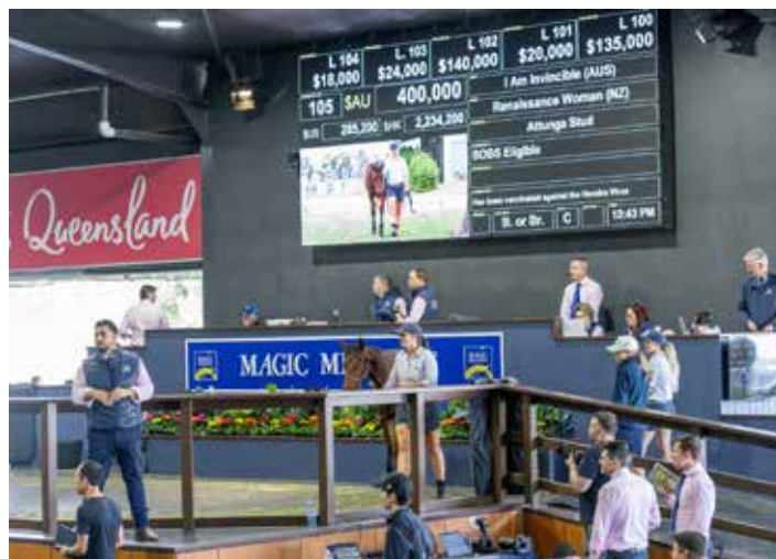
I Am Invincible - Renaissance Woman colt sold to Fernrigg Farm for $400,000