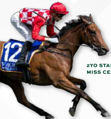
2YO STAKES WINNER, MISS CELINE