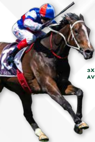
3X STAKES WINNER, AVIATRESS