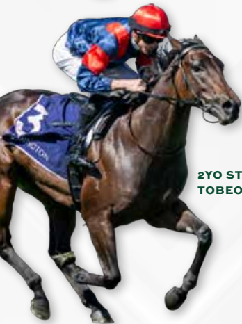
2YO STAKES WINNER, TOBEORNOTTOBE