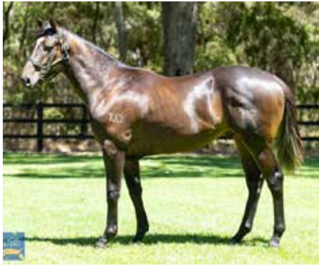
Buthelezi pictured as a yearling