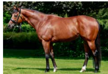
St Mark's Basilica