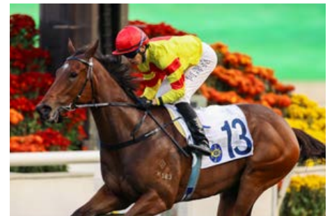
Hot Delight HKJC

can slot in somewhere easy and he can produce a good run like he did previously," he added.