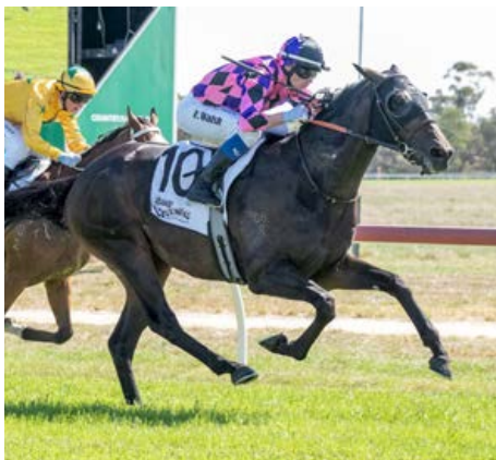
Think Your Amazing