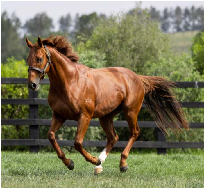
Tiger Of Malay

Chixfromthestix (AUS) (ch f ex Minicoop (AUS) by Sebring (AUS)) R5 (1:08pm): Belmont Park, 2yo Mc Polytrack Plate, 1000m