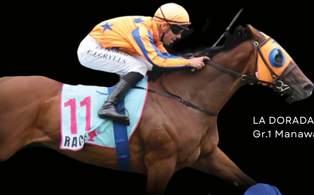
LA DORADA Gr.1 Manawatu Sires' Produce Stakes

ALREADY FROM HIS SECOND CROP A CHAMPION 2YO AND 3 STAKES WINNERS