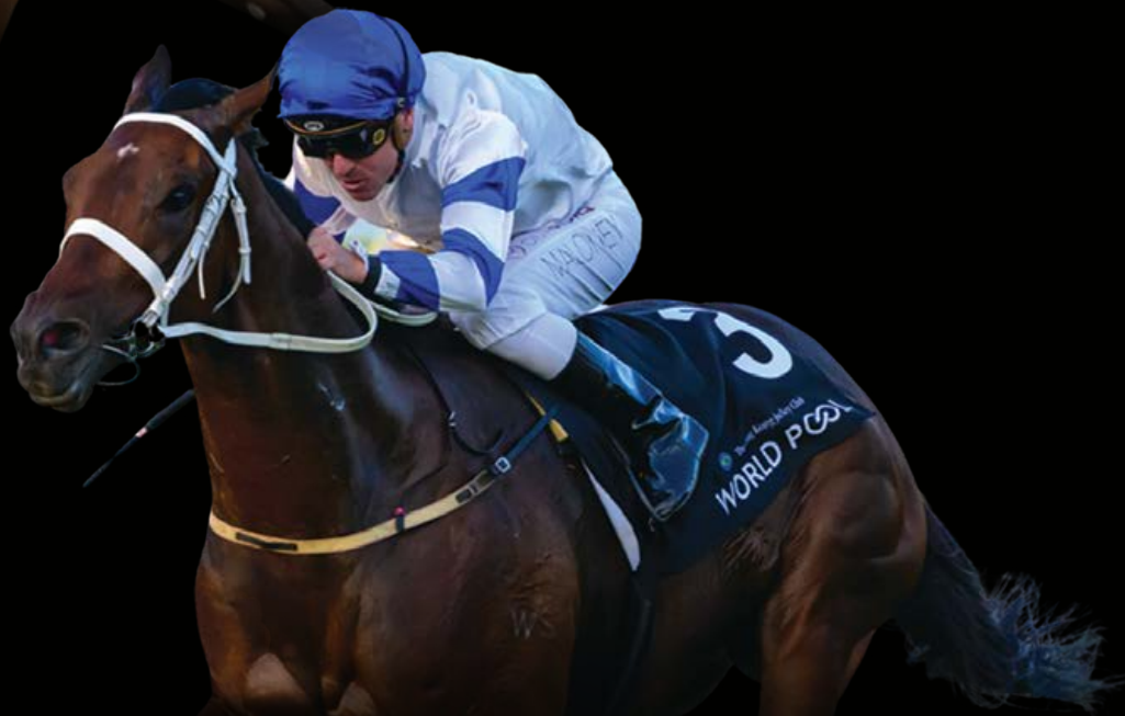
KILMAN Gr.3 Rough Habit