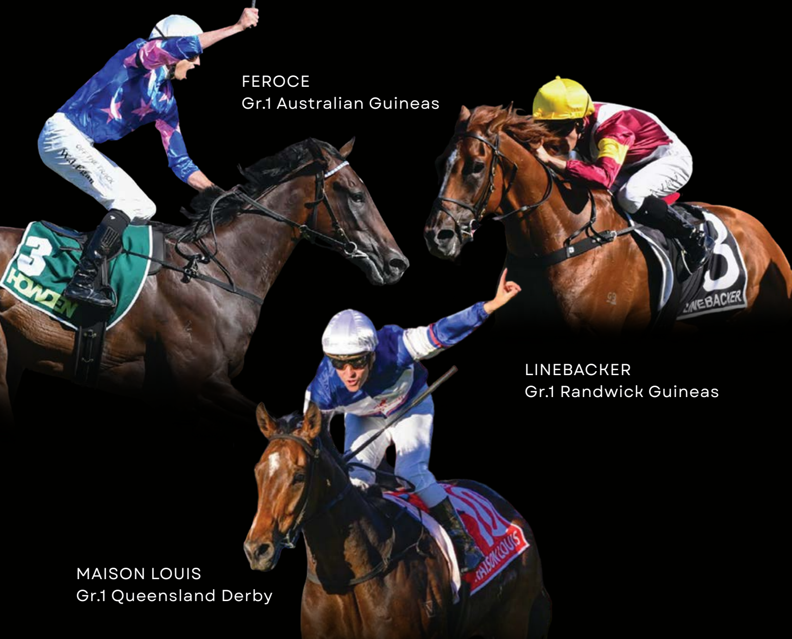
FEROCE Gr.1 Australian Guineas