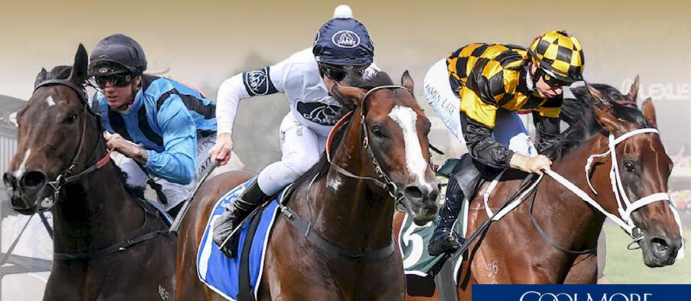
Asfoora, Overpass and Joliestar