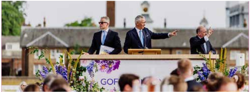
The Goffs London Sale