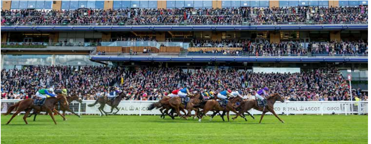
Great Barrier Reef lands Coventry Stakes