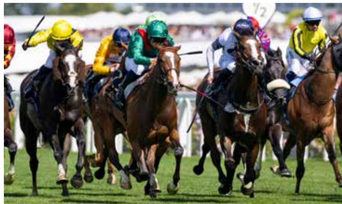
Overpass (navy cap, white silks)

“She has an amazing turn of foot over that distance, when she came, she really came strongly – I thought it was in the bag for us. But on the post, I knew we were beaten