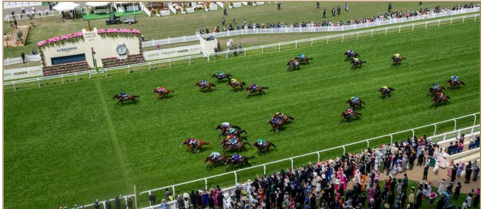
Victorious winning the Queen Mary Stakes