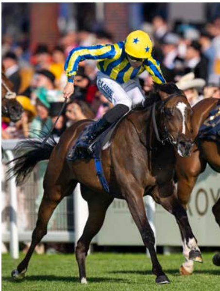
King Of Cloughan