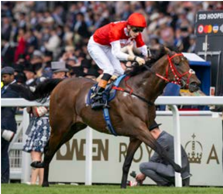
Rogue Diplomat