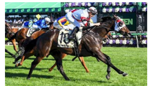
New York Lustre