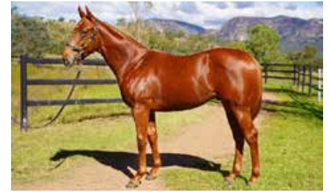
Omolong pictured as a yearling