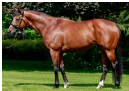
St Mark's Basilica