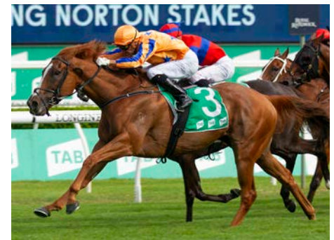
Te Akau Shark

"There have been many highlights over the years on the race track, but winning two Group 1s in half an hour in Sydney this season, with Probabeel and Te Akau Shark, was incredible. Then, a week later we had Cool Aza Beel and Advantage winning Group 1s within an hour of each other at Ellerslie. These sorts of results are very difficult to achieve and were quite something to follow on from Cool Aza Beel becoming our