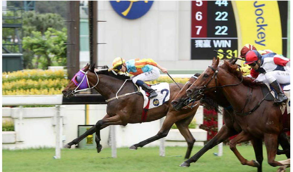
Ka Ying Star

The five-year-old secured the leader's spot under Chad Schofield, who slowed the tempo in the back straight before kicking on down the final stretch. The game bay responded to every urging, holding off the driving challenges of Southern Legend (Not A Single Doubt) and Fast