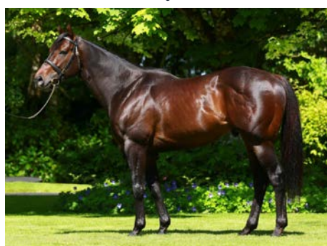
No Nay Never