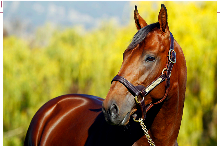
All Too Hard

Last week's Randwick barrier trial victory over 1050 metres reinforced the opinion that