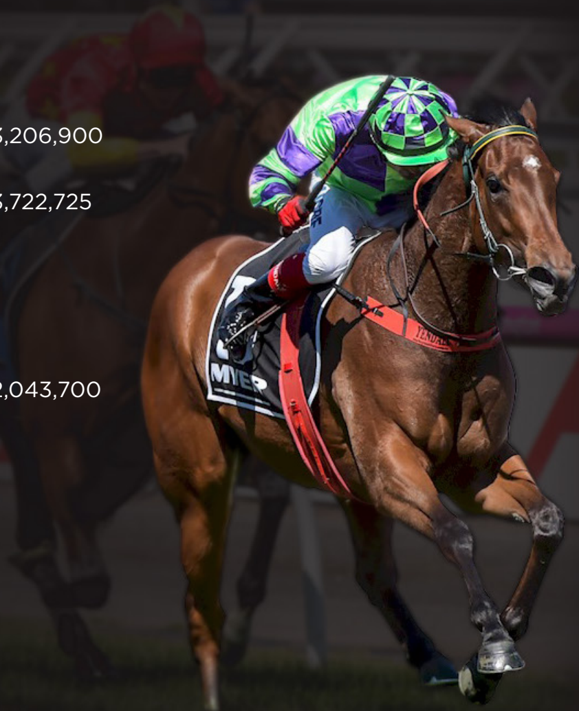
I Am A Star pictured winning the G1 Myer Classic at Flemington.