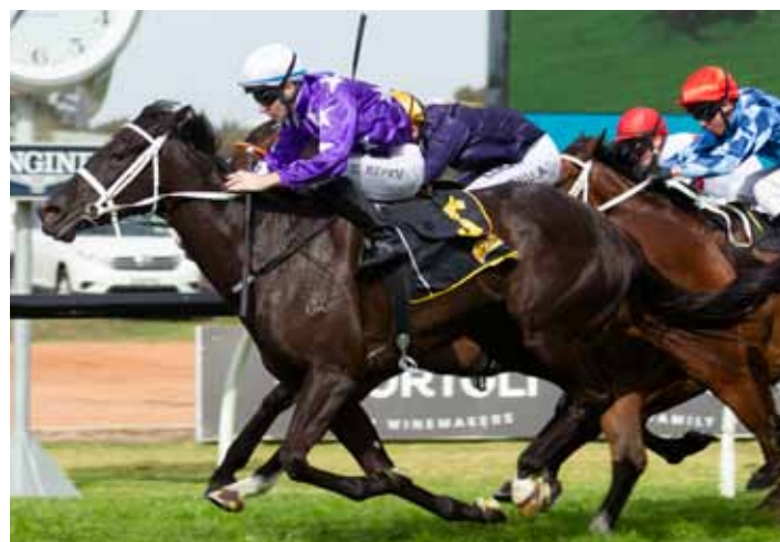
Noire (white cap)

"She was a beautiful sales yearling, has an outstanding pedigree and