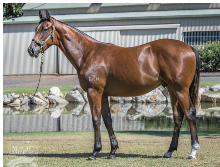
Yes Yes Yes pictured as a yearling