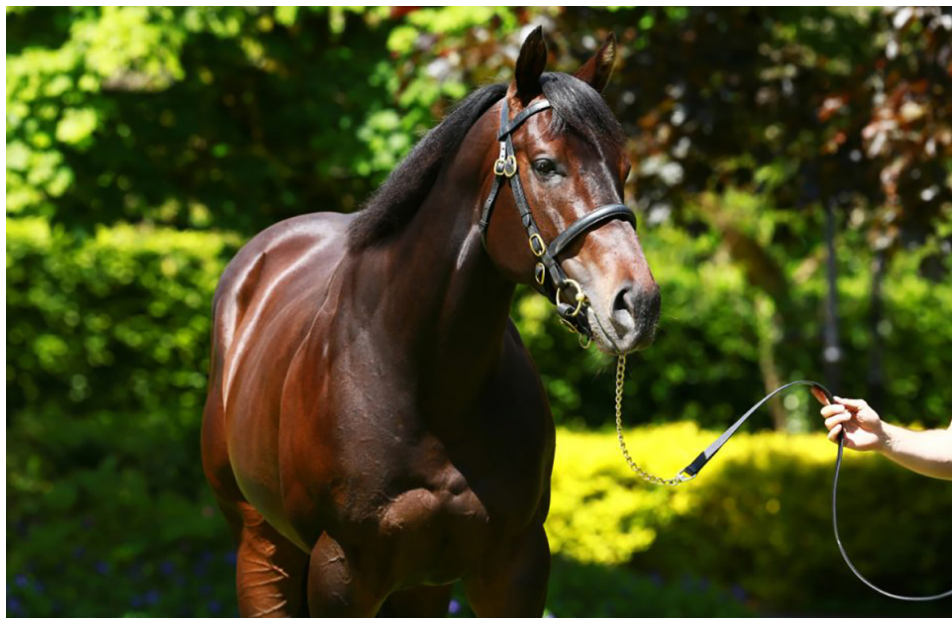
No Nay Never

Press Statement - Vinery Stud resident Press Statement (Hinchinbrook) sired his first winner on Friday when Spokesman (2 c ex Calaluna by Mujahid) broke his maiden second-up over 1250 metres at Canterbury. A $270,000 Inglis Classic Yearling Sale purchase,