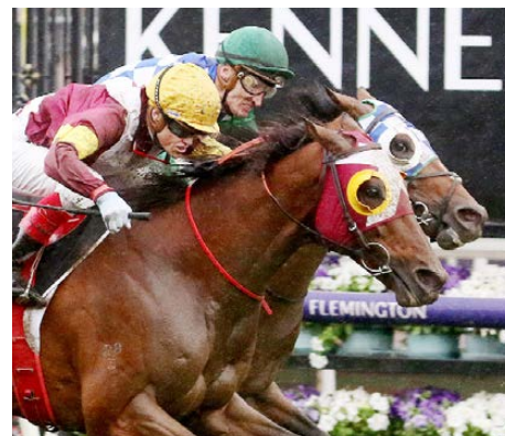
Fierce Impact (yellow cap)