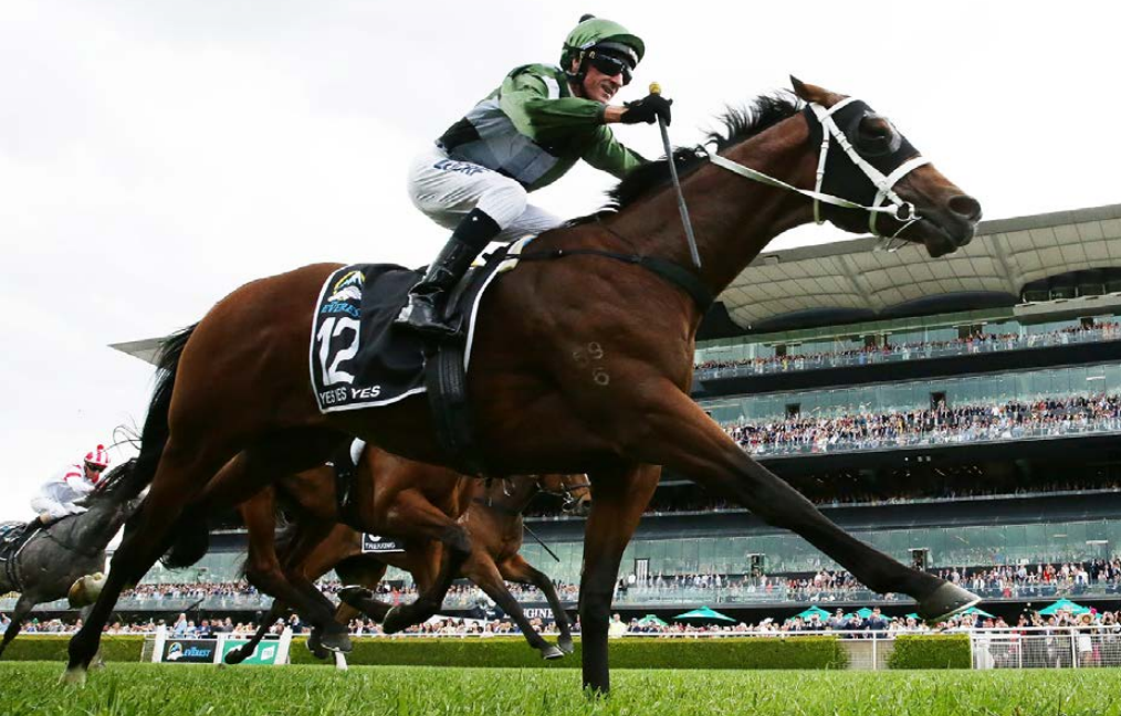
Yes Yes Yes

Royal Ascot campaign abandoned as son of Rubick retired to Coolmore Stud