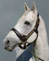
PUISSANCE DE LUNE