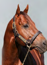
TRUST IN A GUST