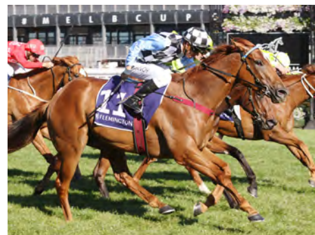
I Am Excited