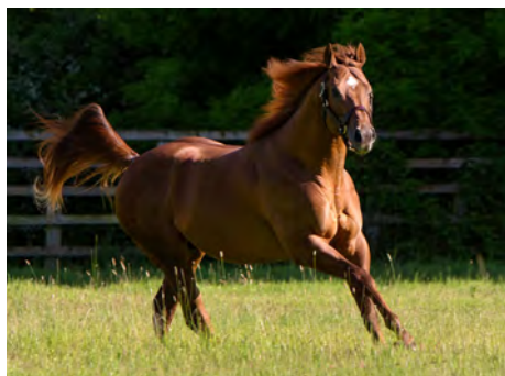
Night Of Thunder