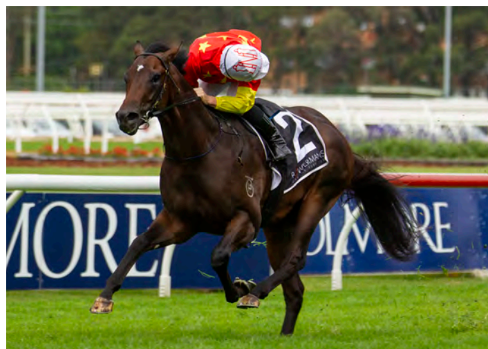
Cosmic Force winning the Pago Pago Stakes