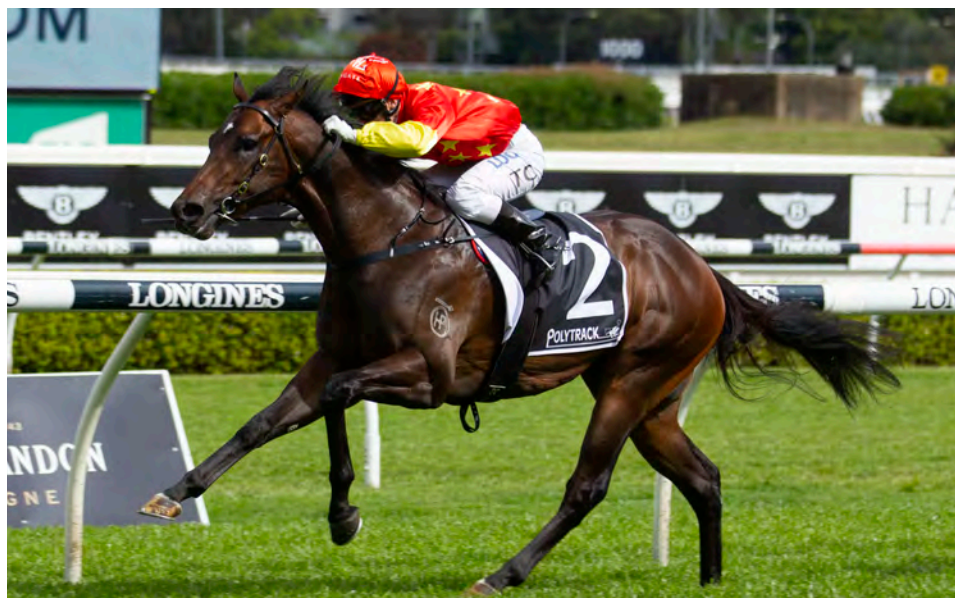
Cosmic Force winning the Roman Consul Stakes

Deep Field to be joined on roster by Group 2-winning son, who will begin his stud career at a fee of $16,500 (inc GST)