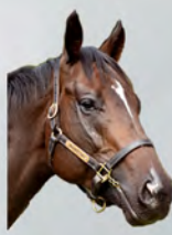
I AM IMMORTAL