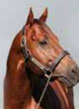
TRUST IN A GUST $6,000 (+GST)