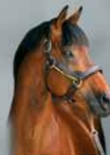
AKEED MOFEED $15,000 (+GST)