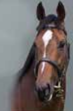
HIGHLAND REEL $15,000 (+GST)