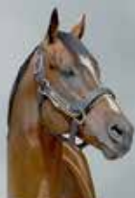
TORONADO $25,000 (+GST)