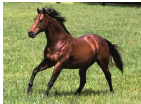
Exceed And Excel