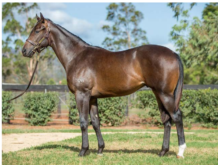
Lot 39 Sebring - Canny Time colt