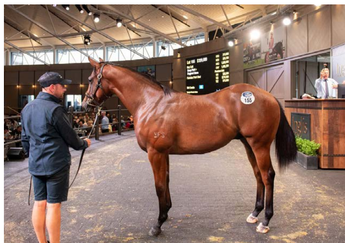
Lot 155 Deep Field - Fragrant Storm colt