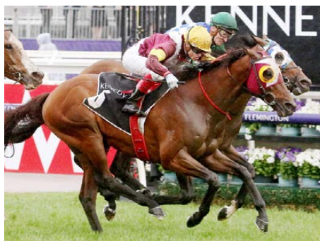
Fierce Impact (yellow cap)