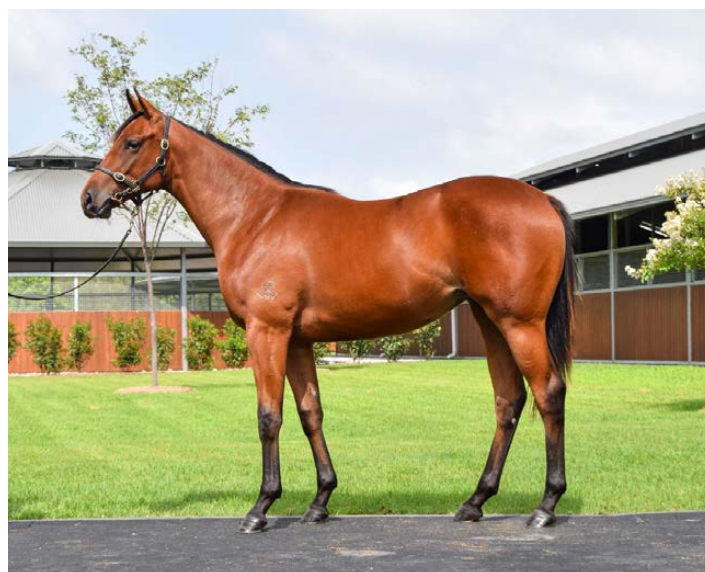
Lot 153 Not a Single Doubt - Forreel filly

"It is highly likely that anything that performs to stakes level will be going back through the broodmare sales in a few years' time."