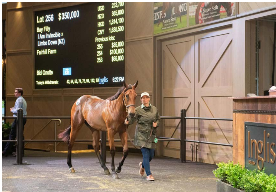
Lot 256 I Am Invincible - Limbo Down filly

Strong finish to Inglis Classic Yearling Sale session as wild weather hits Riverside