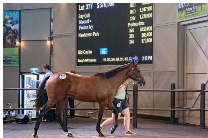
Lot 377 Nicconi - Poison Ivy colt