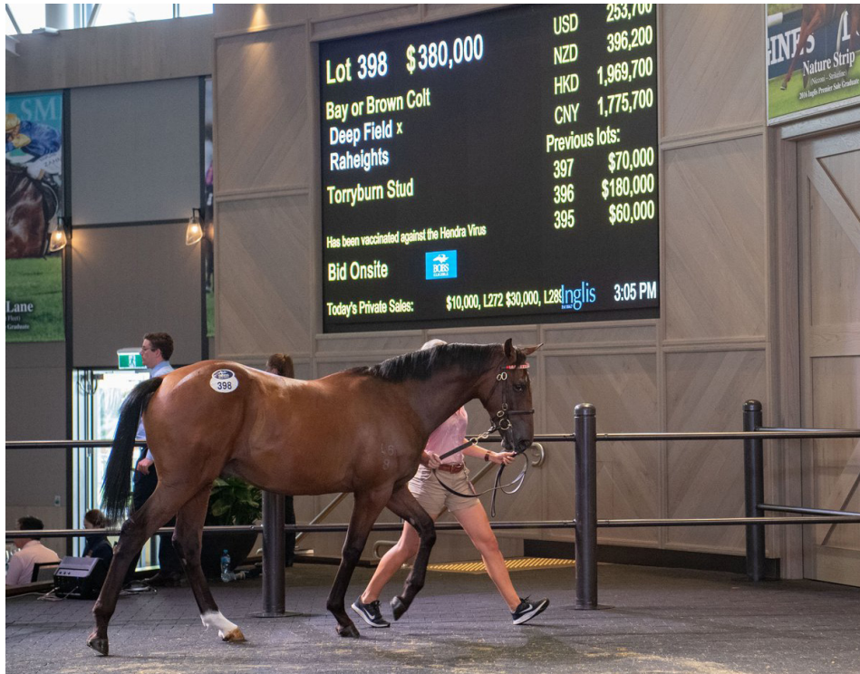
Lot 398 Deep Field - Raheights colt

Ricky Yiu wins sustained bidding duel as buyers demand quality on day two of the Inglis Classic Yearling Sale