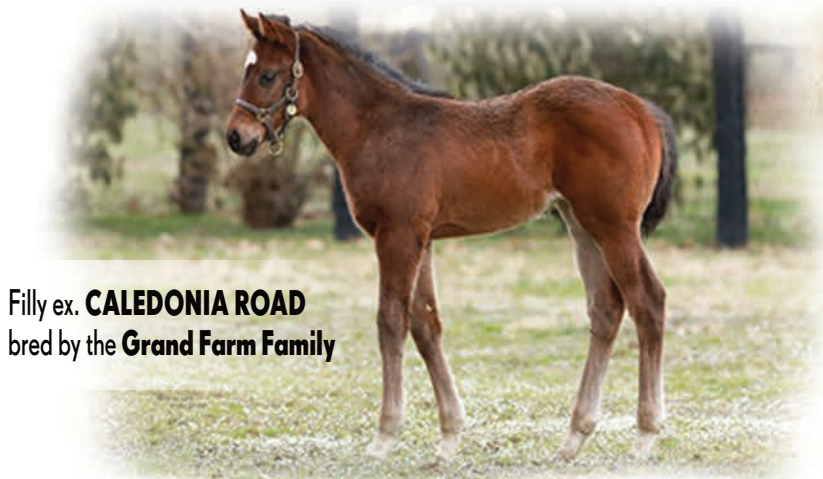
Filly ex. CALEDONIA ROAD bred by the Grand Farm Family