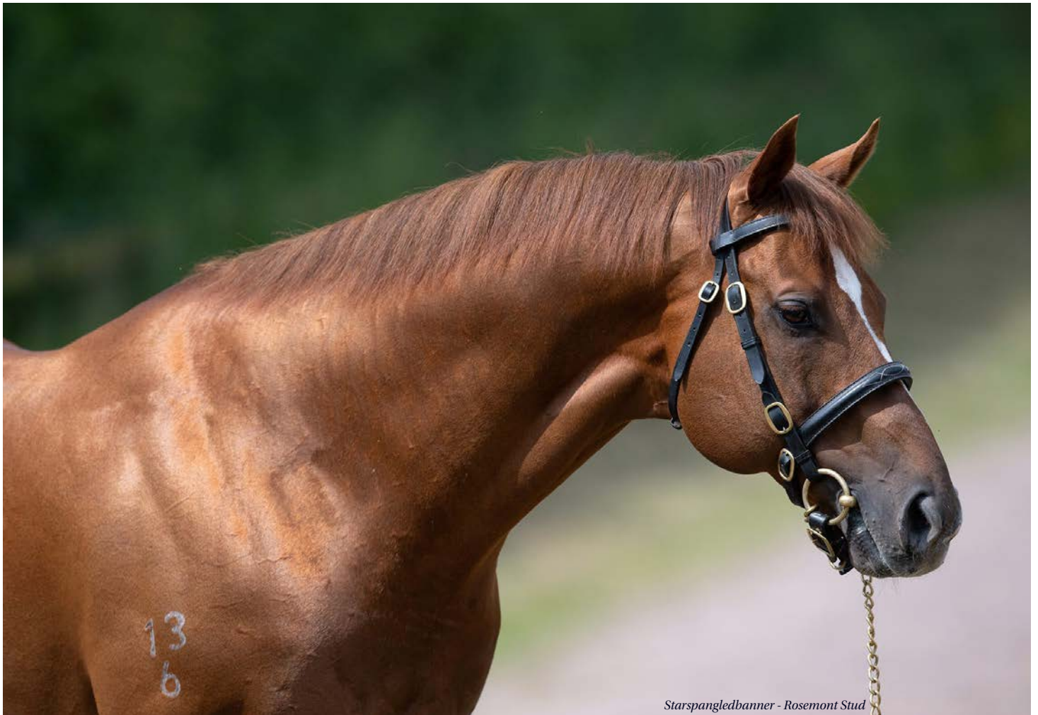
Starspangledbanner - Rosemont Stud