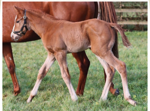
Filly ex. EASTER LILY bred by China Horse Club