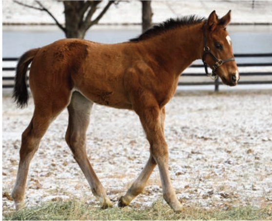
Filly ex. RUBILINDA bred by Don Alberto Corporation