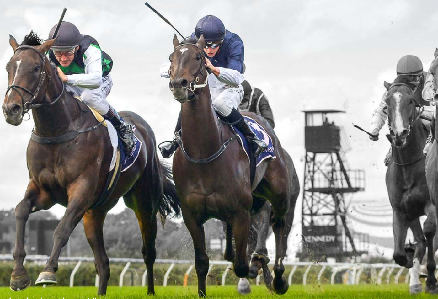
2yos Flying Award and Ironedge run 1-2 in the Anzac Day Stakes (L) at Flemington.