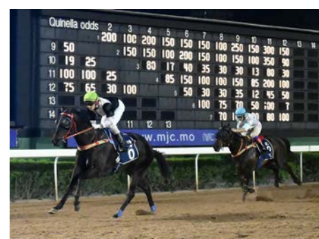
Bring Me Power

running faster time (1.23.3) than his stablemate Bring Me Power who won the last race, the Class 4 in 1.23.5.