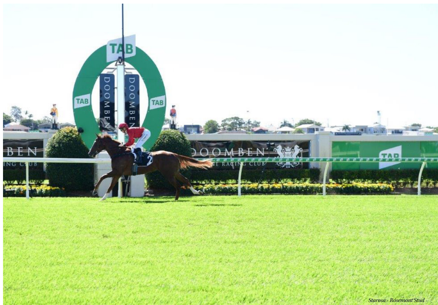
Starosa - Rosemont Stud