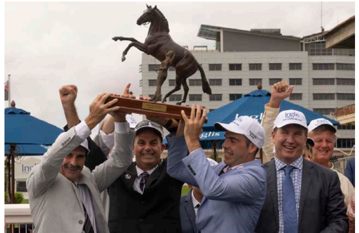
Prime Star presentation

"I'm planning a bit of a return around the middle of March, currently for a week but it may be a good bit longer, all being well," he said.