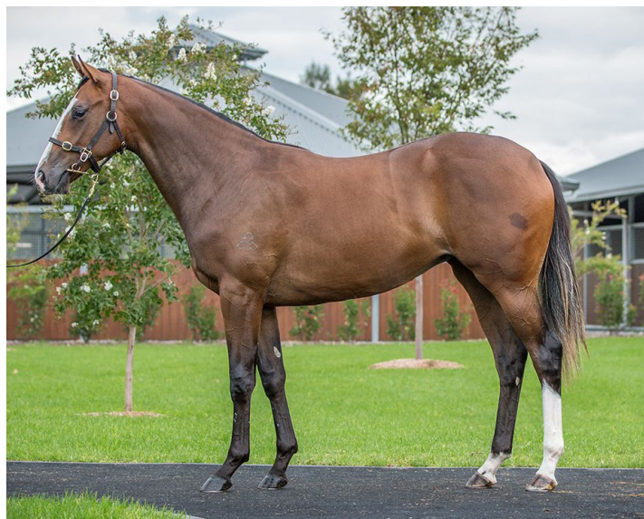
Safe Passage, pictured as a yearling