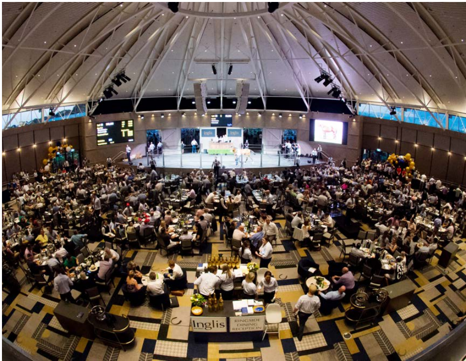
Inglis sales ring

Inglis monitoring situation as Australian government considers European travel ban