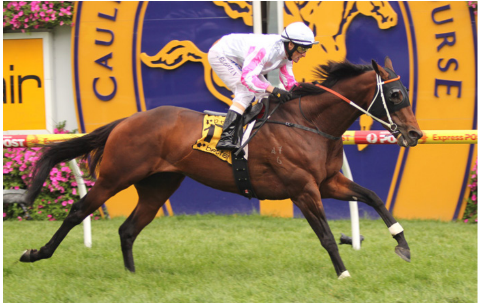
Love Conquers All

Love Conquers All is a Queensland product, having been bred by Glenlogan Park. He was