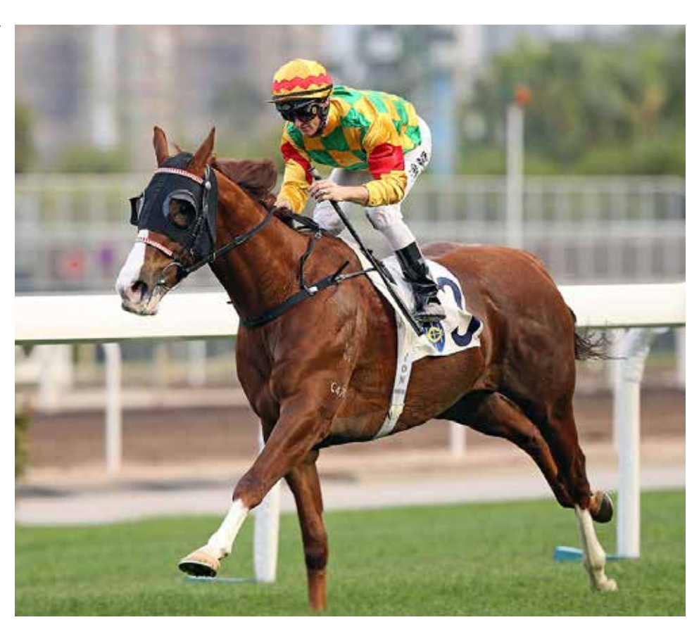
Mighty Giant HKJC

"He's still quite raw, he's very big and he's still working out where to put his legs but he's