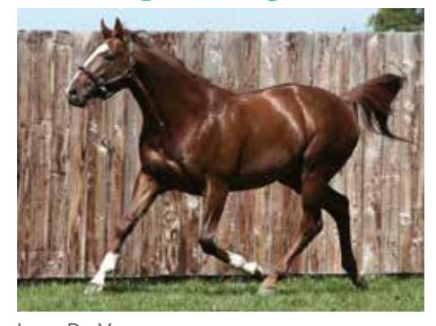
Lope De Vega