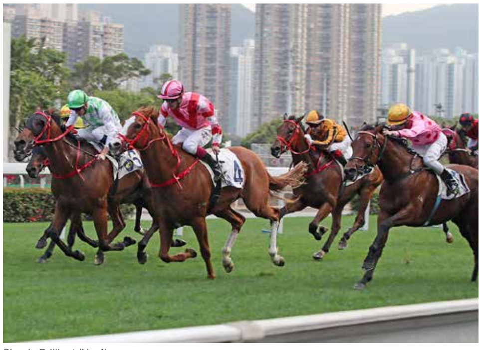
SImply Brilliant (No.4)