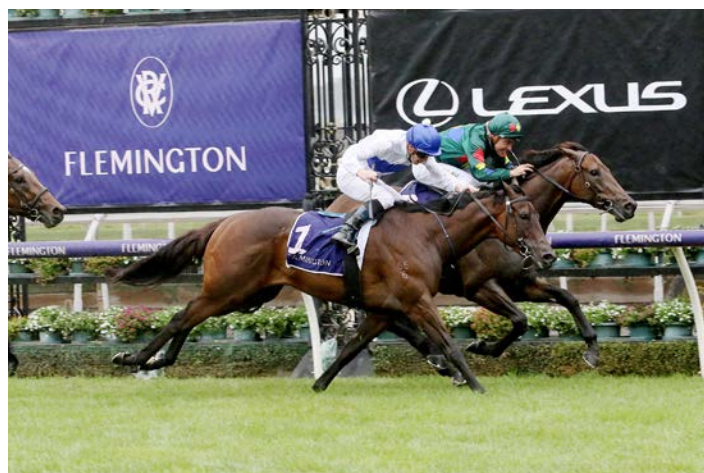
Alligator Blood (rail)

Bonecrusher (Pag-Asa) and Our Waverley Star (Star Way) at Moonee Valley; Redoute's Choice (Danahill) versus Testa Rossa (Perugino) and