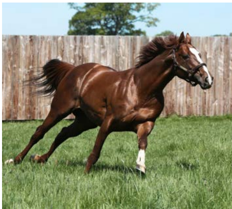
Lope De Vega