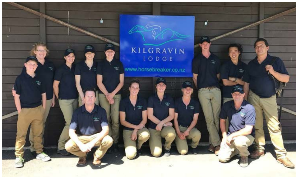
Team of staff at Kilgravin Lodge

"Megan and I sat down in June and thought about what we could do to try and offer something that might be a point of difference and maybe give us an edge over other vendors.