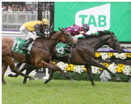
One More Try (rail)