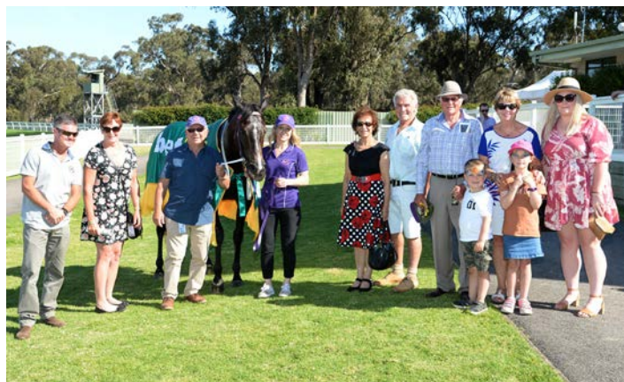
2019 Kilmore Cup winner Al Passem

Churchill Downs (USA) - Chilukki Stakes (Gr 3, 1m). Del Mar (USA) - Native Diver Stakes (Gr 3, 9f). Woodbine (CAN) - Bessarabian Stakes (Gr 2, 7f), Kennedy Road Stakes (Gr 2, 6f), Ontario Derby (Gr 3, 9f)