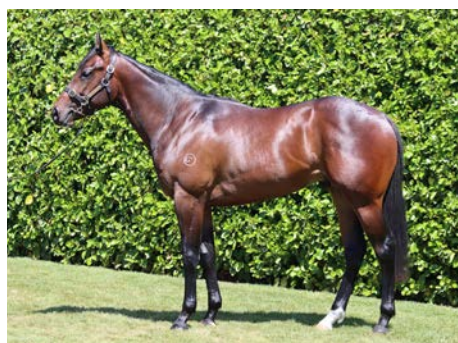
Lot 275 No Nay Never ex Lucky Morna colt

Kemp is hoping the approach will provide them with an edge in the ultra-competitive auction environment which this year will have an extensive offshore buying bench relying heavily on online services due to travel restrictions imposed by the Covid-19 pandemic.