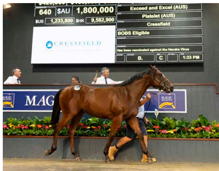
Lot 640 that made $1.8million in January

Lot 857 - Invader half-brother to Wakeful Stakes (Gr 2, 2000m) winner Victoria Quay (Dundeel) - Willow Park Stud