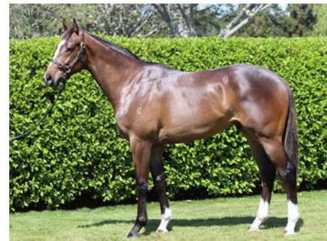
Lot 174 Pierro ex Crystal Fairy colt

"If what we have done makes a buyer choose our horse above two or three others then it will all have been worth it."