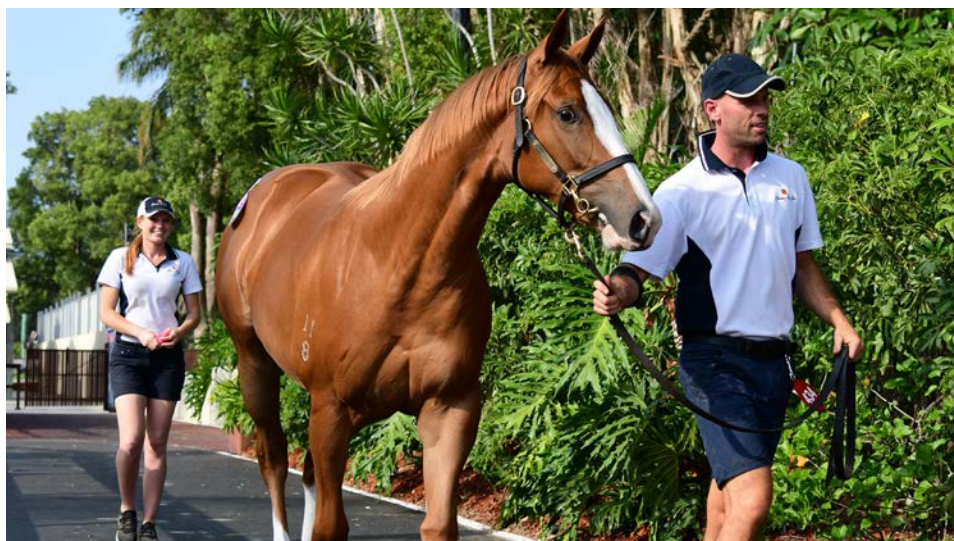
Written Tycoon ex Karuta Queen filly that made $1.5million in January