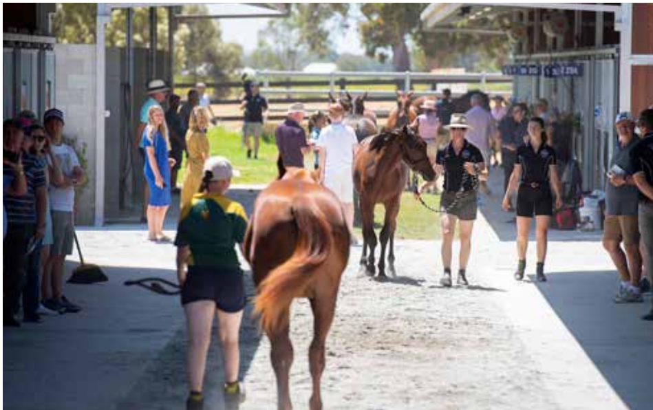
Inspections take place at Inglis' Swan Valley complex yesterday

Traders also expected to seek out value options at Magic Millions auction