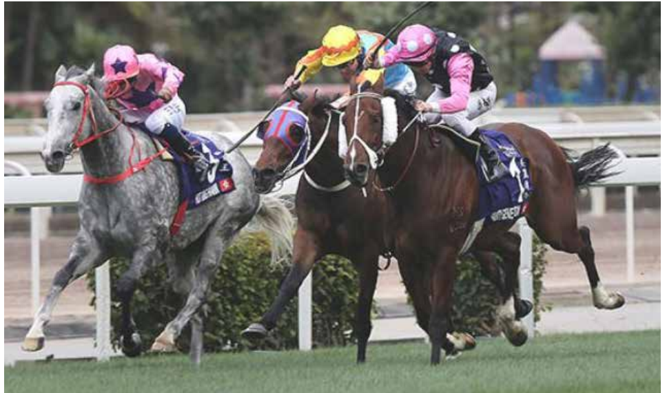
Beauty Generation (right)

"It probably didn't go to script really - we thought we might be able to lead this race