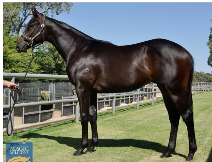
Lot 5 War Chant - Diamonds'n'dreams filly

Parnham, one of WA's leading trainers for nearly four decades, already