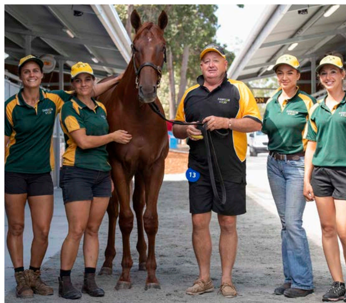
Lot 13 Nicconi - Elite Ateates colt