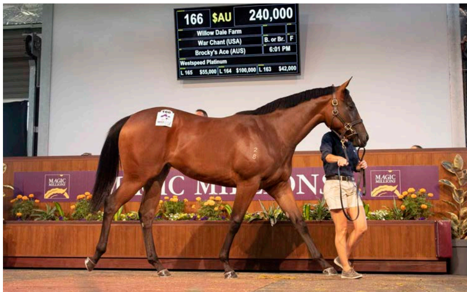
Lot 166 War Chant - Brocky's Ace filly

Half-sister to Group 2 winner Quilista makes $240,000 at Magic Millions Perth Yearling Sale