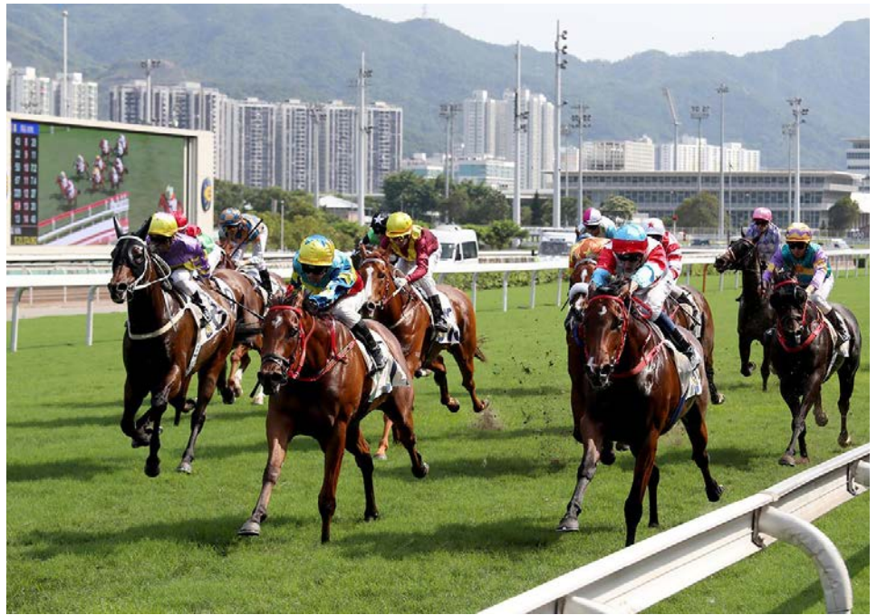
Good View Clarico