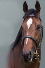
HIGHLAND REEL $15,000 (+GST)