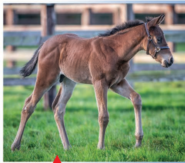
Colt ex. Loved So Much

The only son of DEEP IMPACT at stud to be a Gr.1 winner at both 2 and 3.