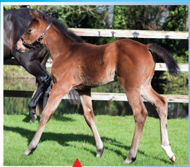
Filly ex. Votka