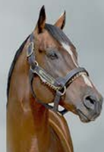
TORONADO $25,000 (+GST)