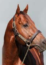
TRUST IN A GUST $6,000 (+GST)