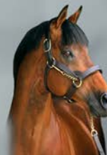
AKEED MOFEED $15,000 (+GST)