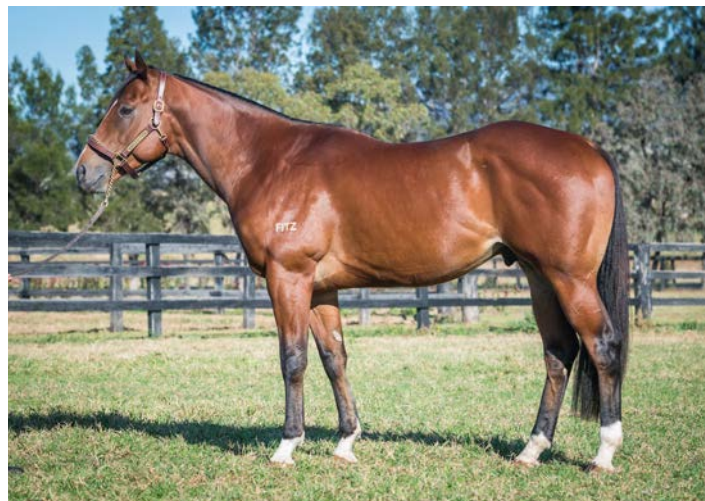
Unite And Conquer

"He showed that he was a very good, early two-year-old, which I think is