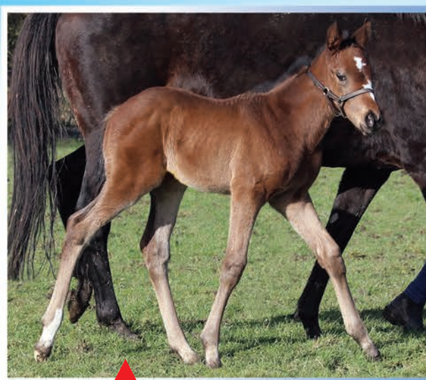
Filly ex. Miss Understood