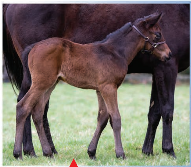
Colt ex. Aktoria