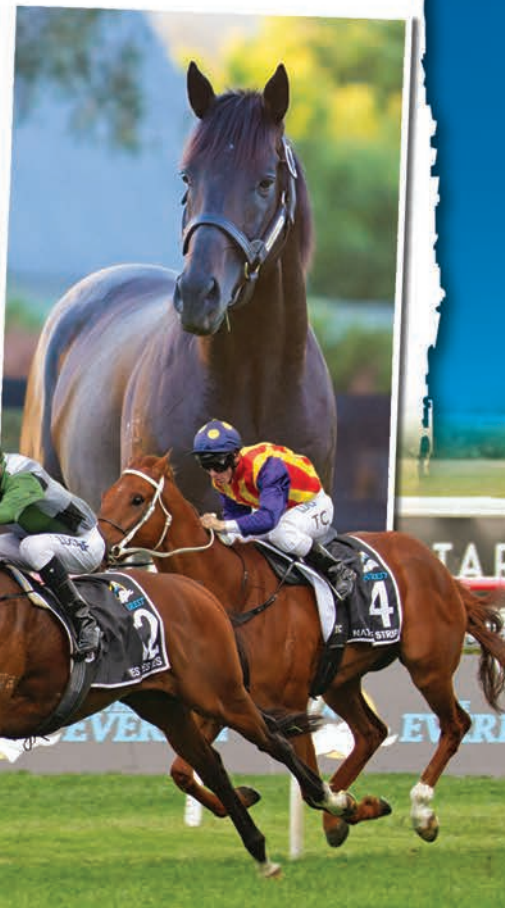
Yes Yes Yes ( RUBICK ) wins the $14 million The Everest