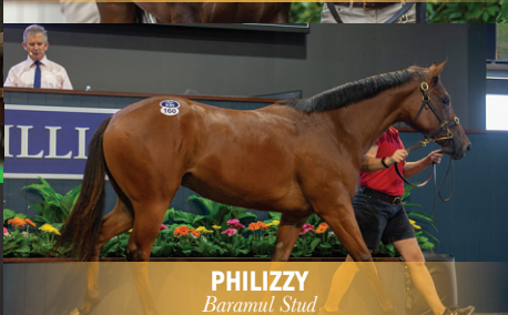
PHILIZZY Baramul Stud