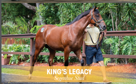
KING'S LEGACY Segenhoe Stud