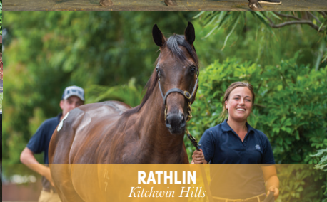
RATHLIN Kitchwin Hills