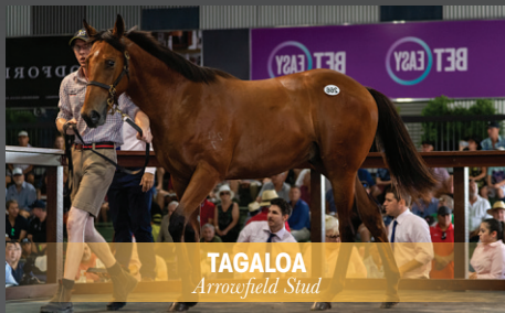
TAGALOO Arrowfield Stud

Best of luck to the Magic Millions sold runners in the World's Richest 2YO Race