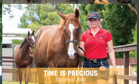
TIME IS PRECIOUS Baramul Stud