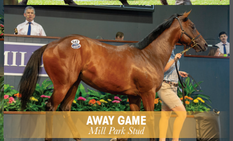
AWAY GAME Mill Park Stud