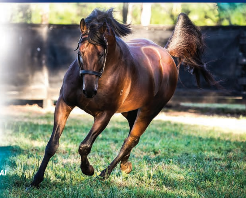
Yes Yes Yes ( RUBICK ) wins the $14 million The Everest