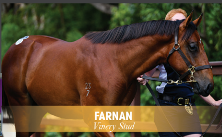
FARNAN Vinery Stud