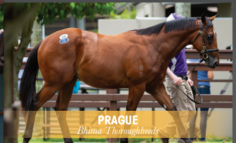
PRAGUE Bhima Thoroughbreds