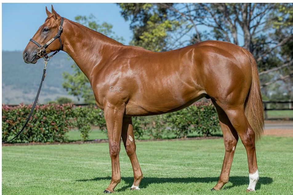
Cultural Amnesia as a yearling

2YO Maiden Plate, 1400m, March 18, Randwick-Kensington