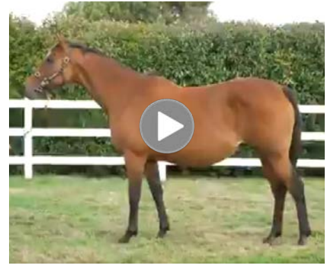
She's Curvaceous (video)

Trope is a half-brother to three Stakes performers by sons of Danehill (Danzig), including tomorrow's Golden Slipper Stakes (Gr 1, 1200m) runner Personal (Fastnet Rock). His granddam is blue hen producer Procrastinate (Jade Hunter), dam of Laisserfaire (Danehill),