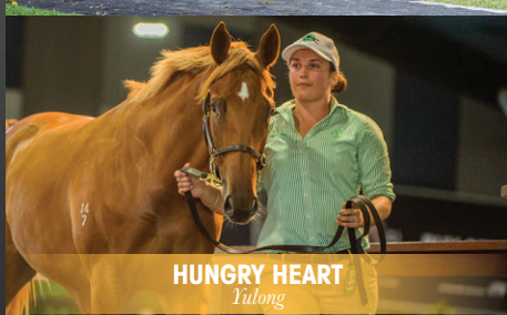
HUNGRY HEART Tulong