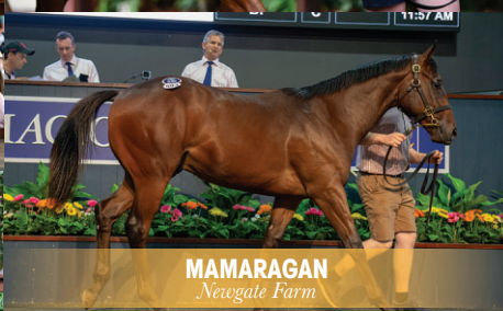
MAMARAGAN Newgate Farm