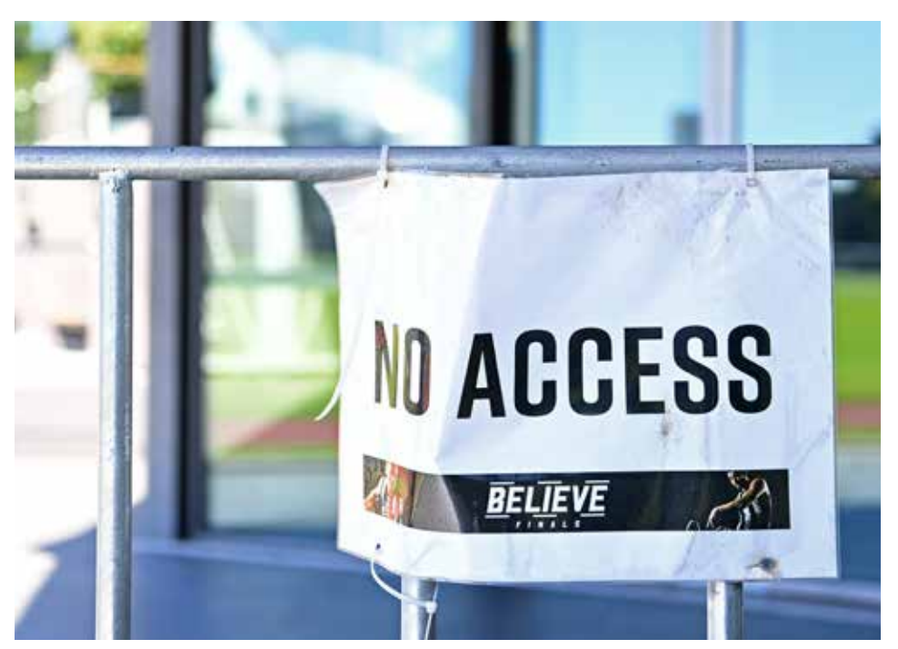
Sports across Australia are being restricted as a result of COVID-19

Decision on whether crowd-free meetings can continue expected to be made today