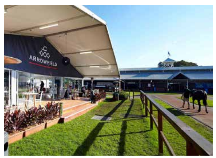
The Inglis Easter Yearling Sale hangs in the balance

South Australia and Western Australia yesterday joined the Northern Territory in effectively closing their borders, with anyone entering those