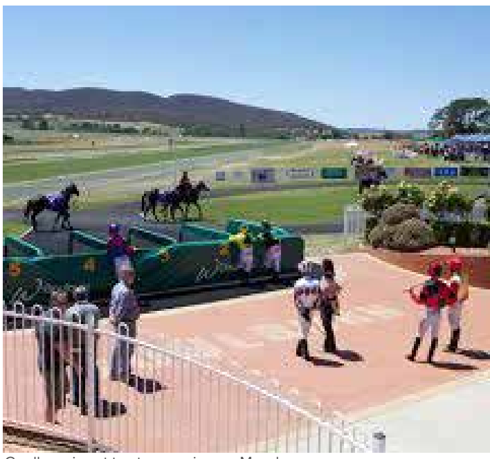
Goulburn is set to stage racing on Monday

"I was pretty close to the GFC (when at the AFR) and this is nothing to the GFC. The GFC was a stroll in the park compared to this. The GFC did not have mass shutting down of economic activity,