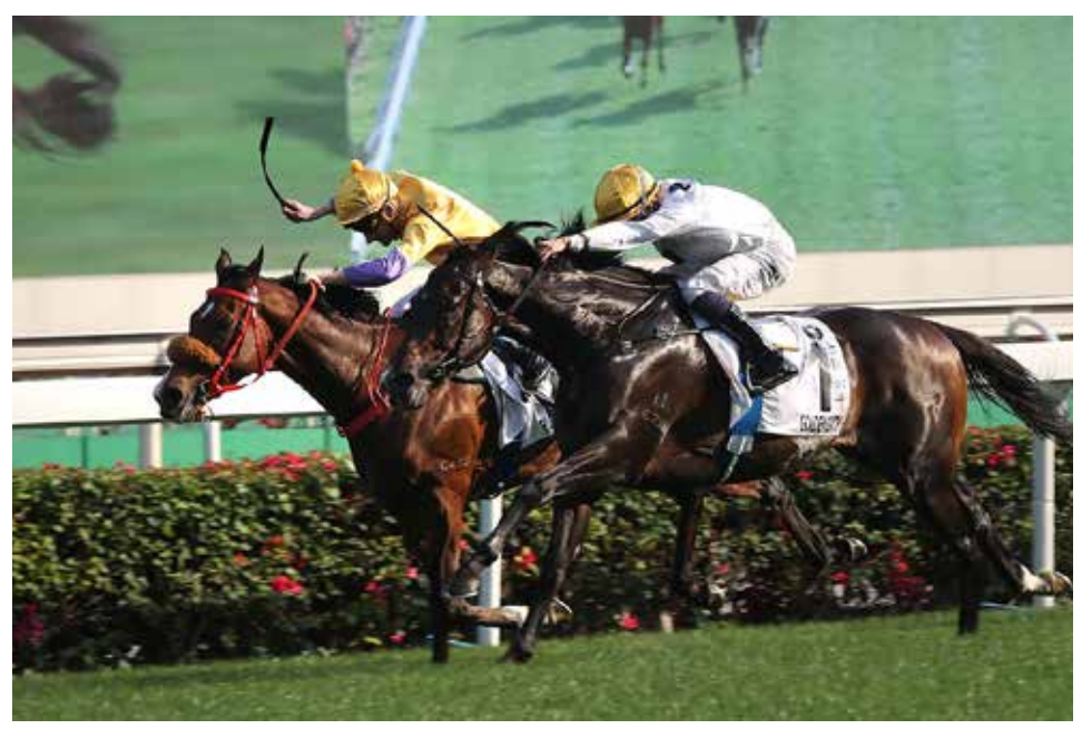
Golden Sixty (near-side) challenges Playa Del Puente

"Round the bend, they slowed down the pace and that's why the other horse was able to run away but Golden Sixty showed excellent