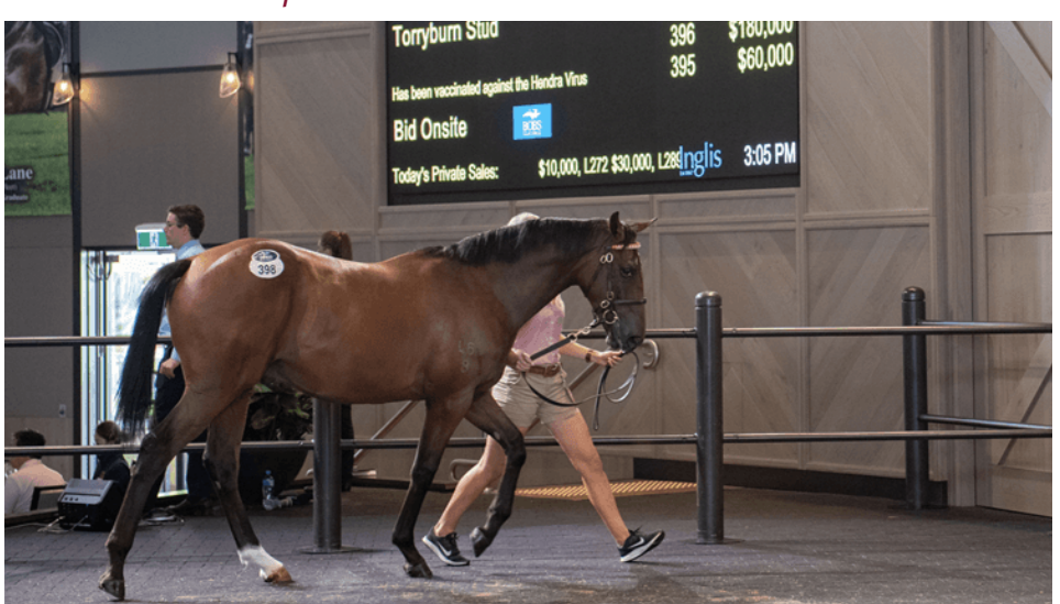
Deep Field - Raheights colt who made $380,000 at last year's Classic Sale

'Riverside Stables opener the most underestimated sale on the calendar'