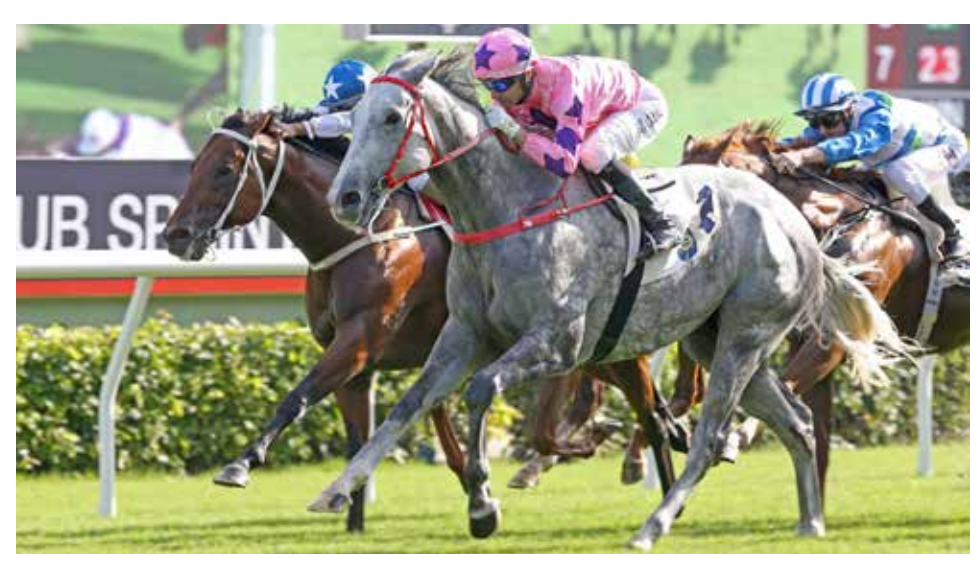
Hot King Prawn

There is no guarantee Hot King Prawn will line-up as Hong Kong's prime contender in the Hong Kong Sprint, with newly-imported The Everest (1200m) winner Classique Legend (Not A Single Doubt) – trained by Caspar Fownes – being forwarded as the division's latest pin-up. Size, though, is not concerned.