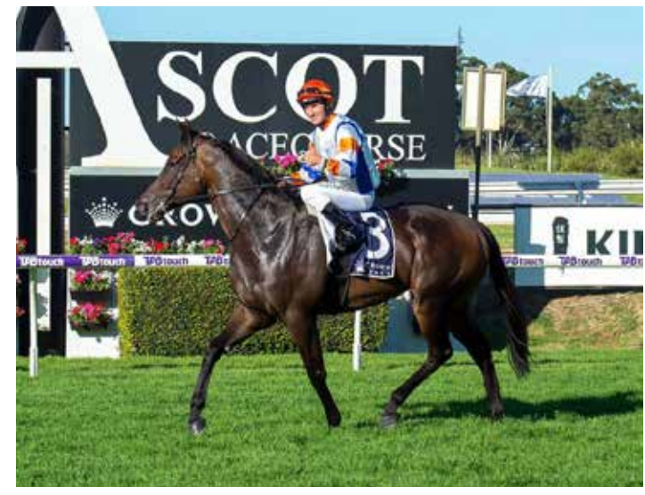
Last year's Winterbottom Stakes winner Hey Doc

INTERNATIONAL MEETINGS: Taipa (MAC), Tokyo (JPN), Hanshin (JPN), Wolverhampton (UK), Turffontein (SAF), Kenilworth (SAF), Churchill Downs (USA), Aqueduct (USA), Del Mar (USA) INTERNATIONAL GROUP RACES: Hanshin (JPN) - Kyoto Nisai Stakes (Gr 3, 2000m). Turffontein (SAF) - Gauteng Summer Cup (Gr 1, 2000m), The Dingaans (Gr 2, 1600m), Ipi Tombe (Gr 2, 1600m), Magnolia Handicap (Gr 3, 1160m), The Merchants (Gr 3, 1160m). Churchill Downs (USA) - Golden Rod Stakes (Gr 2, 8.5f), Kentucky Jockey Club Stakes (Gr 2, 8.5f). Aqueduct (USA) - Discovery Stakes (Gr 3, 9f), Long Island Stakes (Gr 3, 11f). Del Mar (USA) - Hollywood Derby (Gr 1, 9f), Seabiscuit Handicap (Gr 2, 8.5f), Jimmy Durante Stakes (Gr 3, 1m) INTERNATIONAL SALES: Tattersalls December Sale - Weanlings (UK)