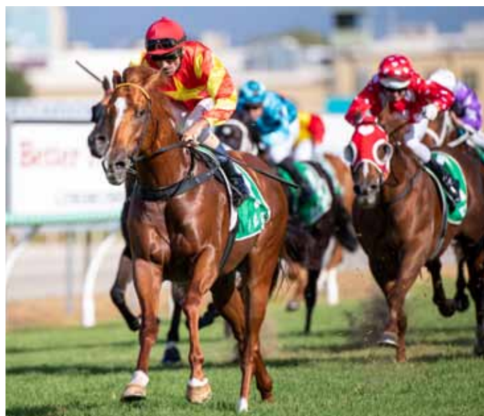
Wisdom Of Water

"The plan is to go to Danehill, Blue Sapphire and the Coolmore with