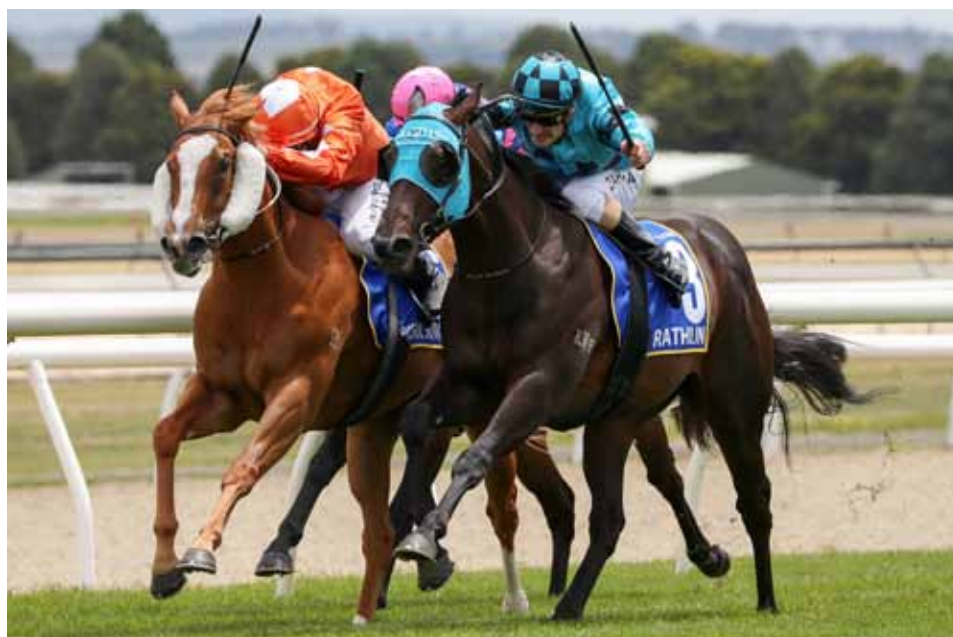
Euphoric Summer (orange)

Trainer finds it hard to split Parlophone and Euphoric Summer in Adelaide