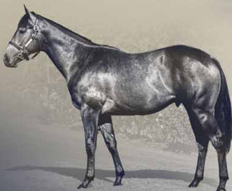
$1.1 million yearling

Magic Millions National Broodmare Sale — 27-29 July 2020