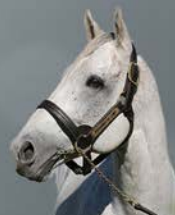
PUISSANCE DE LUNE