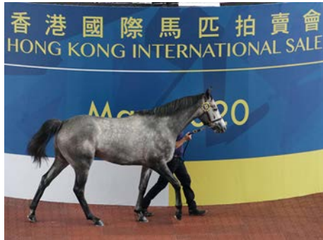
Lot 11 Kodiak ex Coolnagree