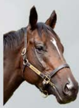
I AM IMMORTAL