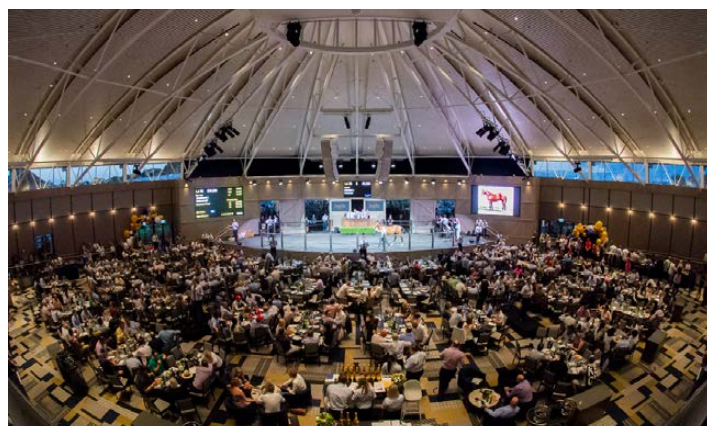
Inglis sales ring

Privately, some vendors are pessimistic about the appetite of buyers to overextend themselves at next month's sale and have even made recommendations to some clients that holding onto their stock to race, rather than putting them through the ring, was an alternative that needed to be considered.