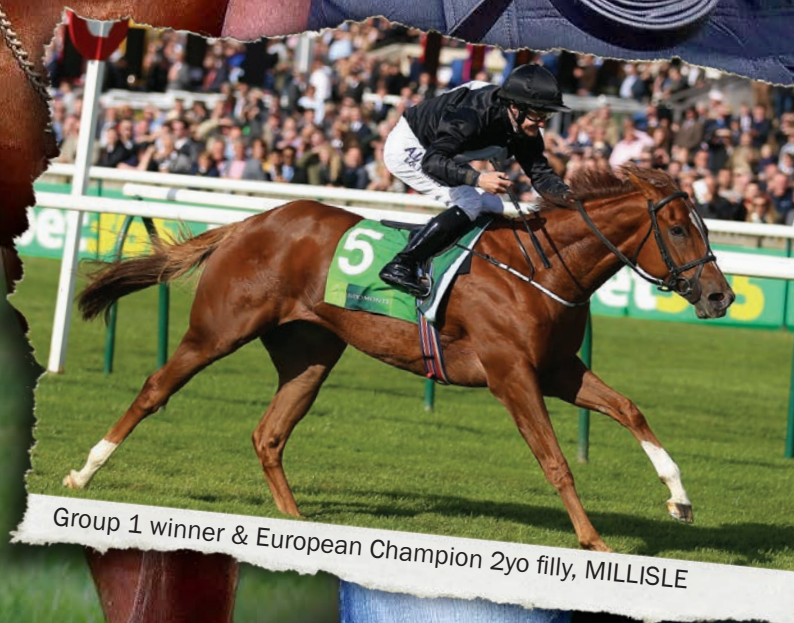
Group 1 winner & European Champion 2yo filly, MILLISLE