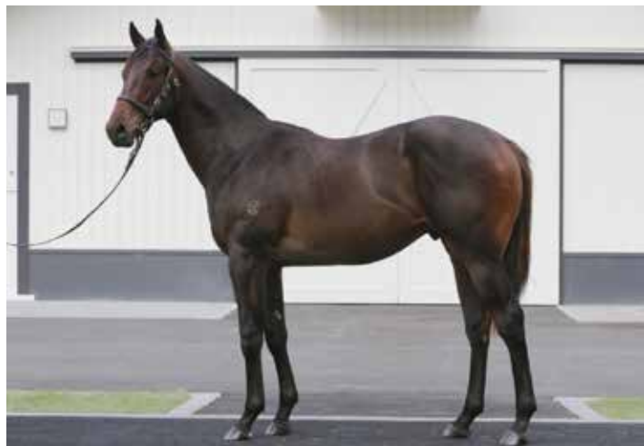
Lot 342 Lonhro - Thames Court colt