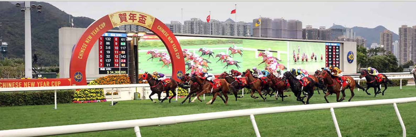
Chinese New Year Cup