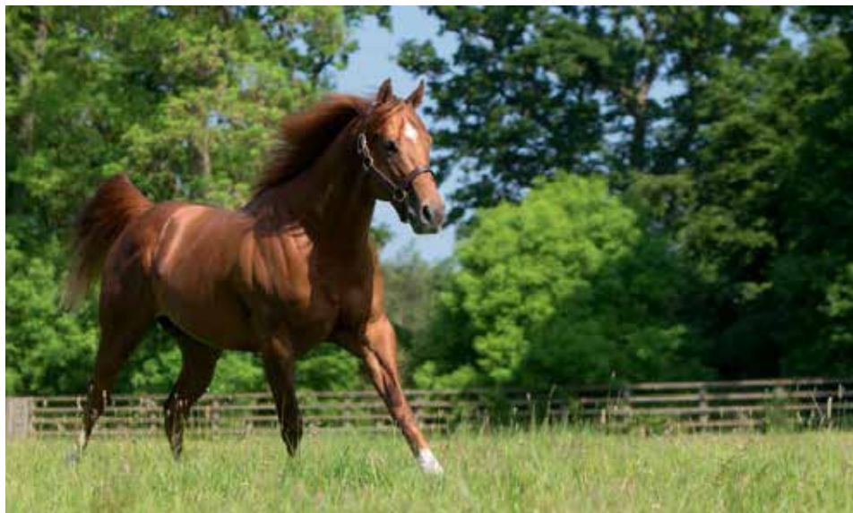
Night Of Thunder