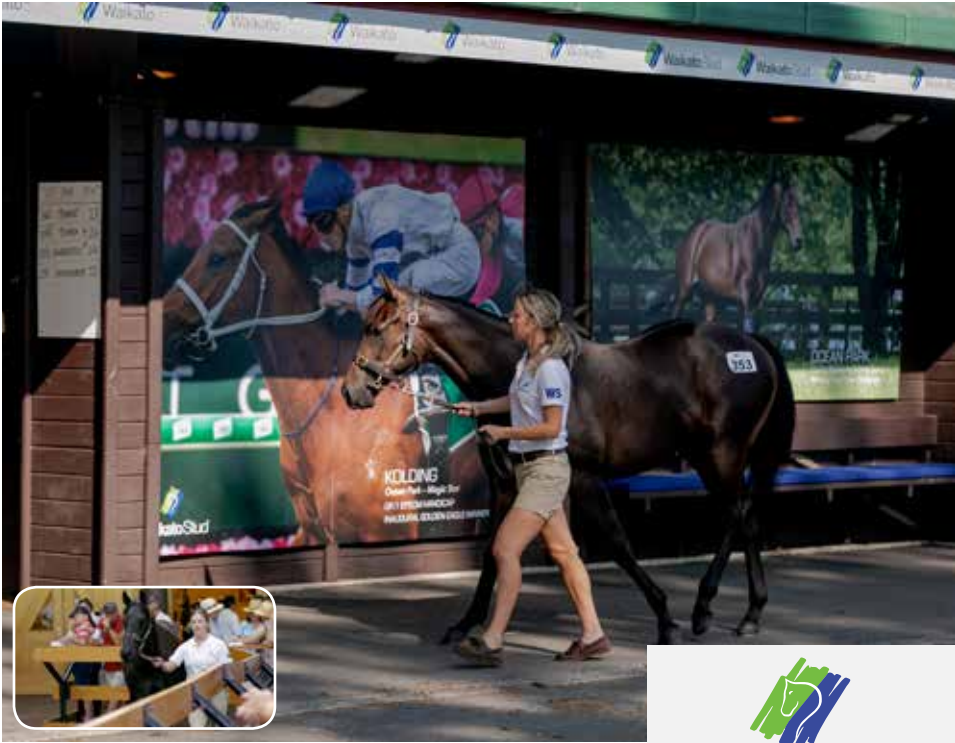
Please see HERE for the Waikato Stud wrap video from today