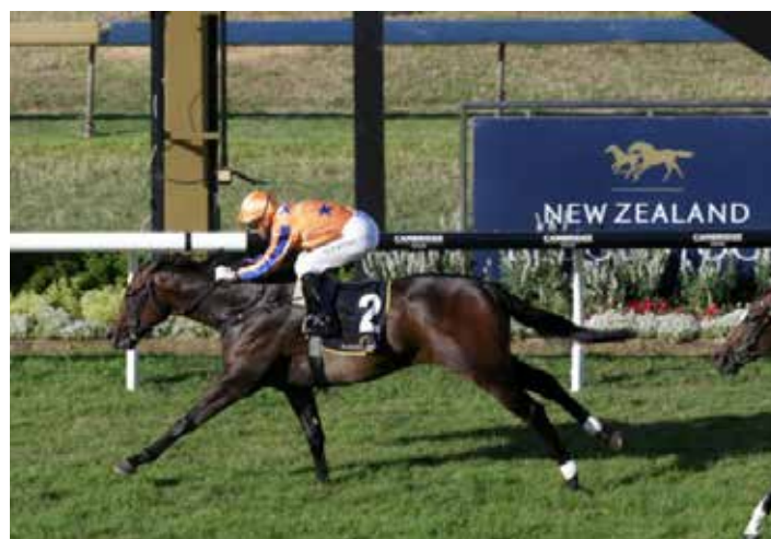
Cool Aza Beel