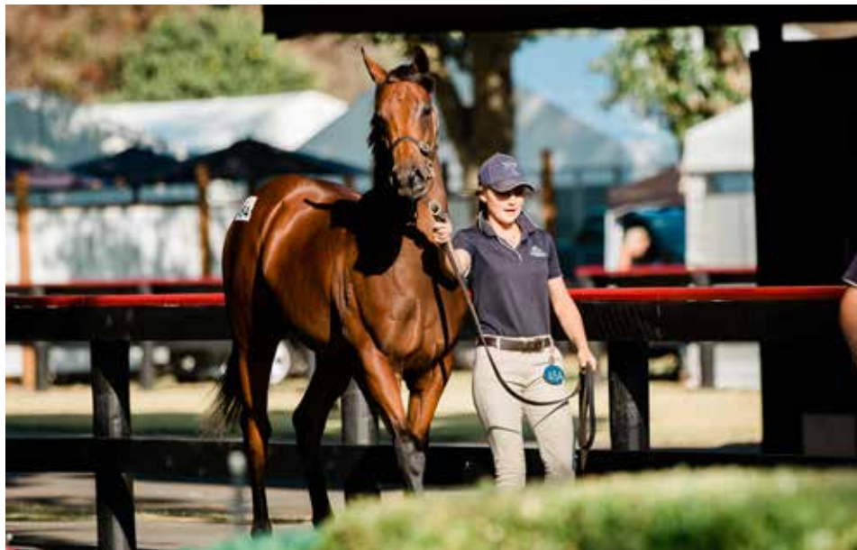
Lot 454 Savabeel - Bayrock colt