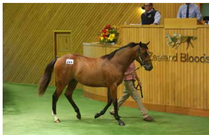
Lot 241 Tivaci - Ruqqaya colt

"If you look at the pedigrees of all three lots in our hectic half hour, we have been involved with their dams and granddams, on the track first, then at the farm," he said.