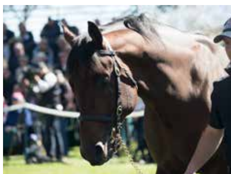
Pride Of Dubai