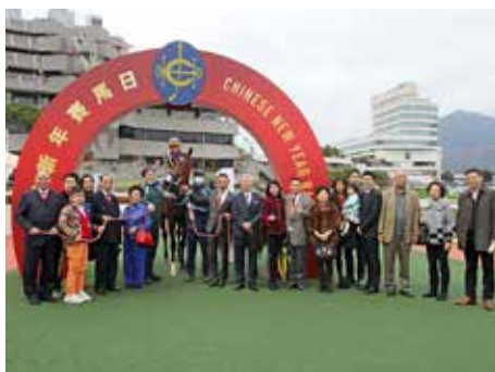
Perfect Match winning connections

Golden Sixty positioned third-last on the