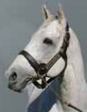
PUISSANCE DE LUNE