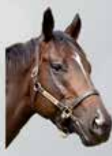
I AM IMMORTAL