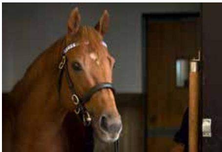
Night Of Thunder