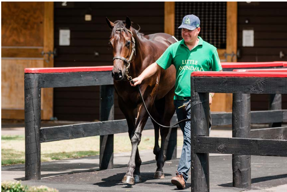
Lot 726 Per Incanto - Makkura colt

Constance Cheng-bred $160,000 colt bound for Hong Kong after Foote strikes