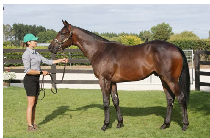
Lot 775 Contributor - Parvati colt