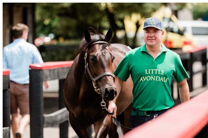
Lot 726 Per Incanto - Makkura colt