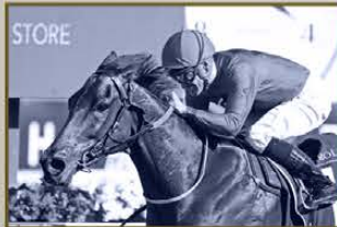
ANGEL OF TRUTH