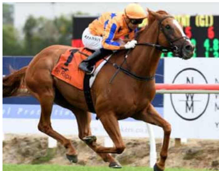
Te Akau Shark

The in-form Kiwi Ida (Squamosa), who was aiming for a fourth