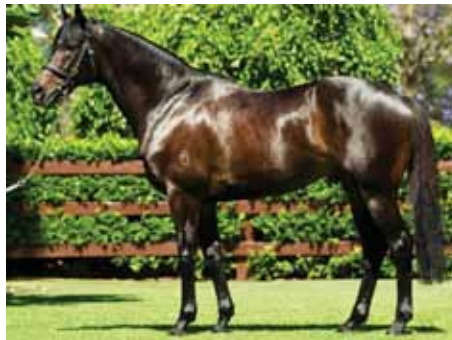
So You Think