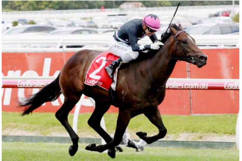
I Am Immortal

"I Am Immortal was a very fast, precocious two-year-old (who is) easily one of the fastest