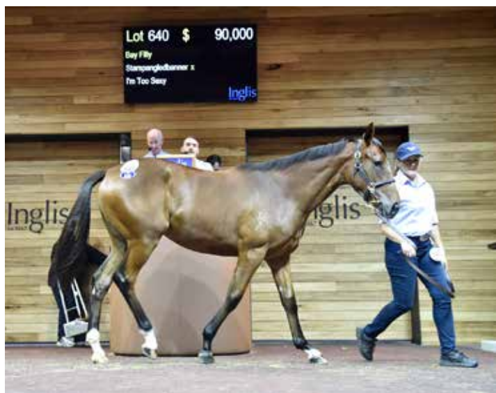
Lot 640 Starspangledbanner - I'm Too Sexy filly

"I wanted another Super Vobis filly and she fitted the bill really well.