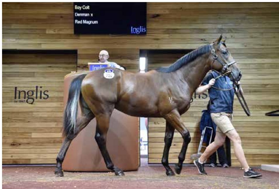
Lot 720 Denman - Red Magnum colt

Becker confident about future of state's breeding industry after Book 2 of Inglis Sale concludes